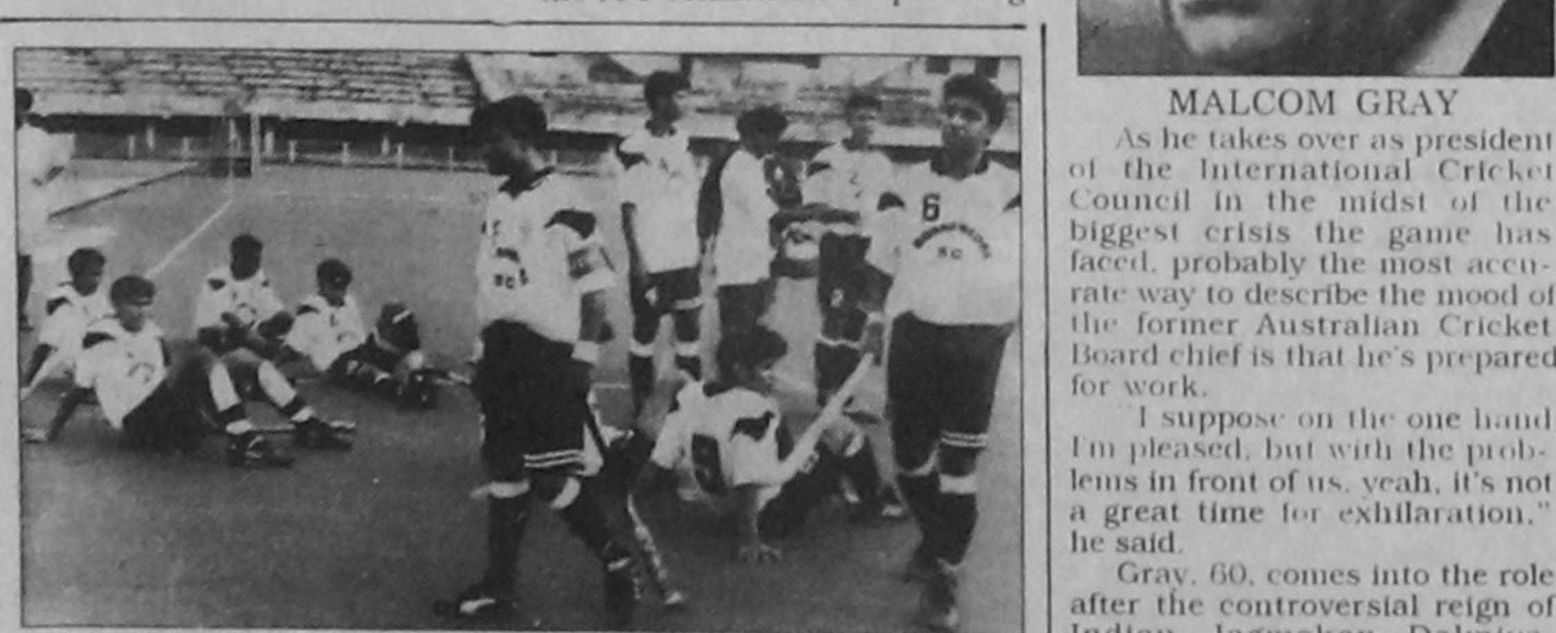
Mohammedan players sitting on the pitch in protest against a ruling during their Rabig Ali Gold Cup hockey tournament encounter with Mariner Youngs at the Maulana Bhasani Stadium yesterday.