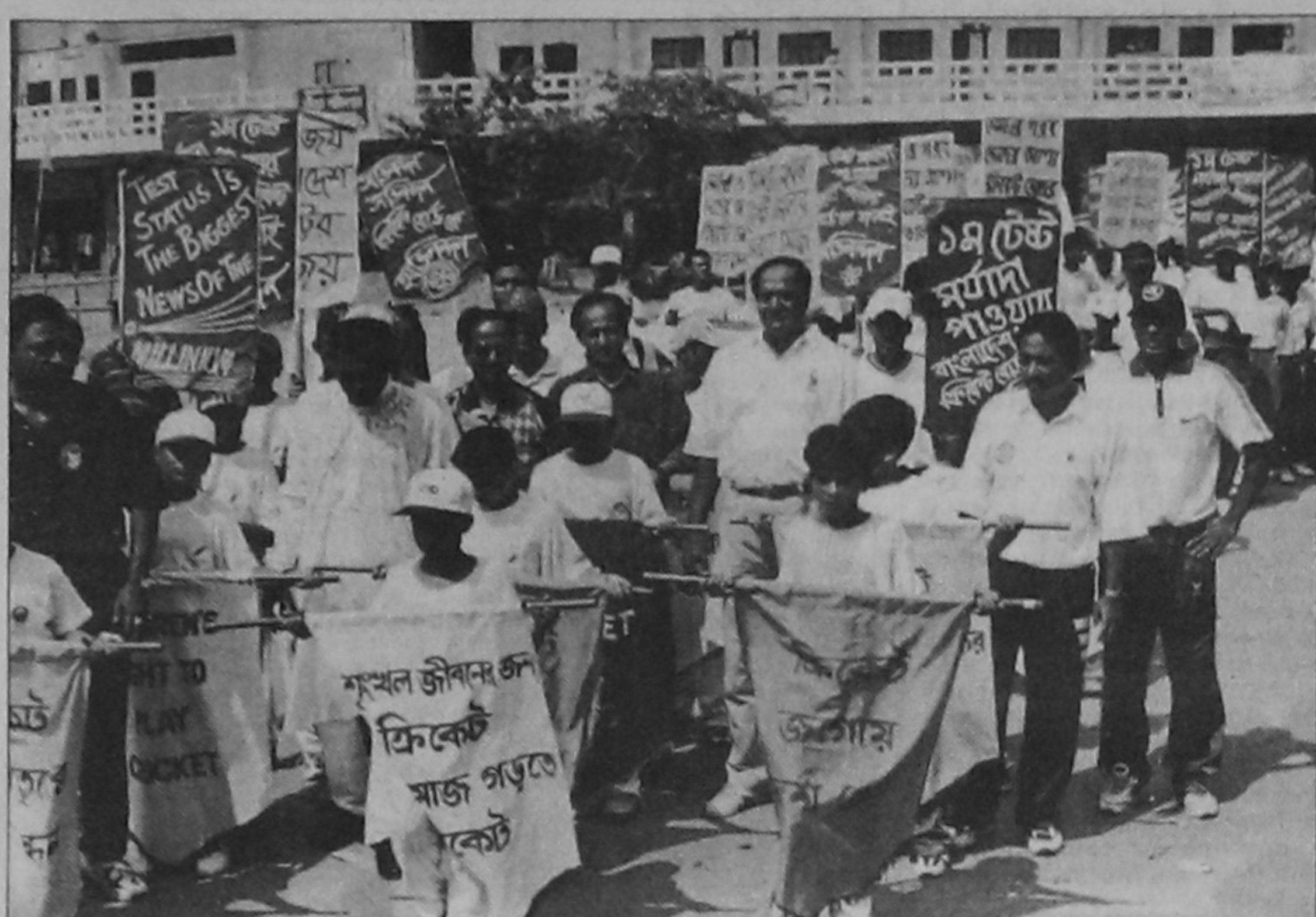
Tiny tots from different coaching centres of the city parading through the streets near the Bangabandhu National Stadium hailing Bangladesh's attainment of Test status yesterday.

The match will now be held tomorrow. The remaining fixtures will bodily be shifted.