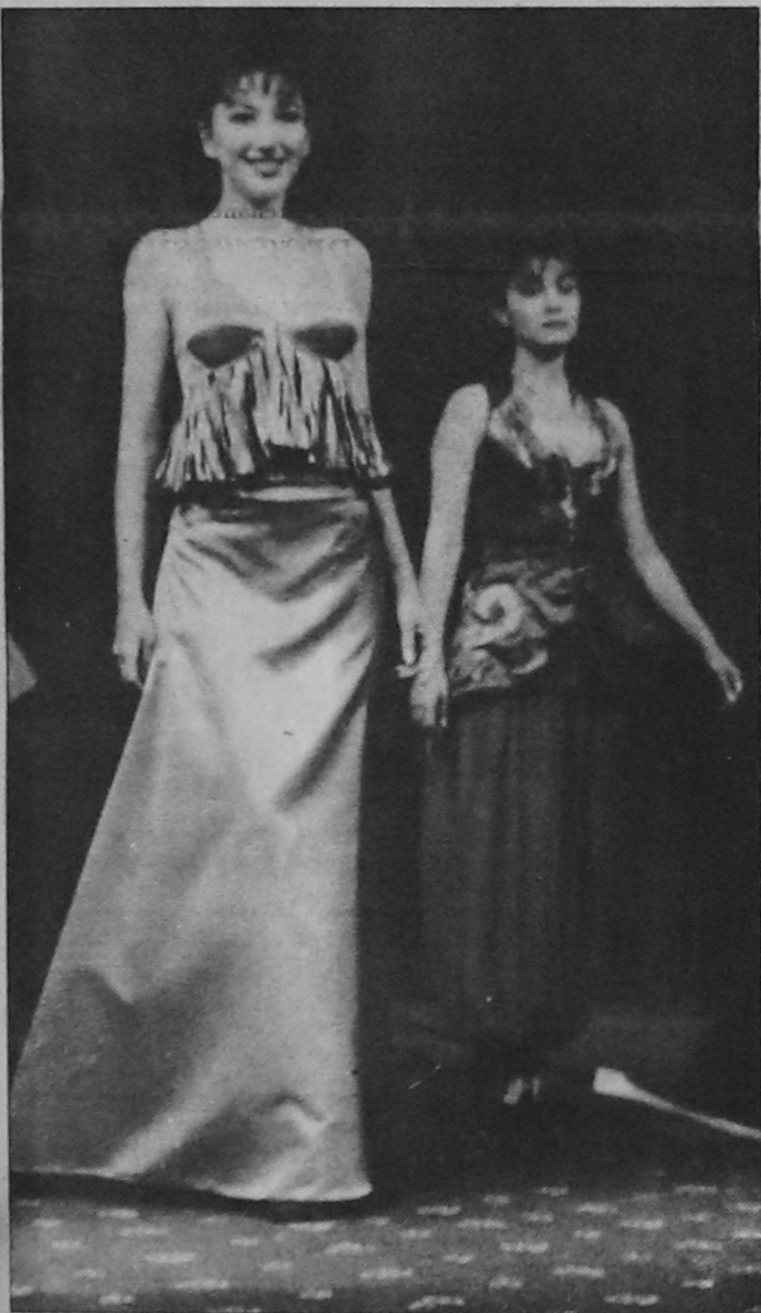
A fashion show was held at Sheraton Hotel on the first day of the 5-day Uzbek Food & Cultural Festival yesterday. Dhaka Sheraton Hotel and Airspan Ltd, GSA of Uzbekistan Airways, jointly organised the festival.