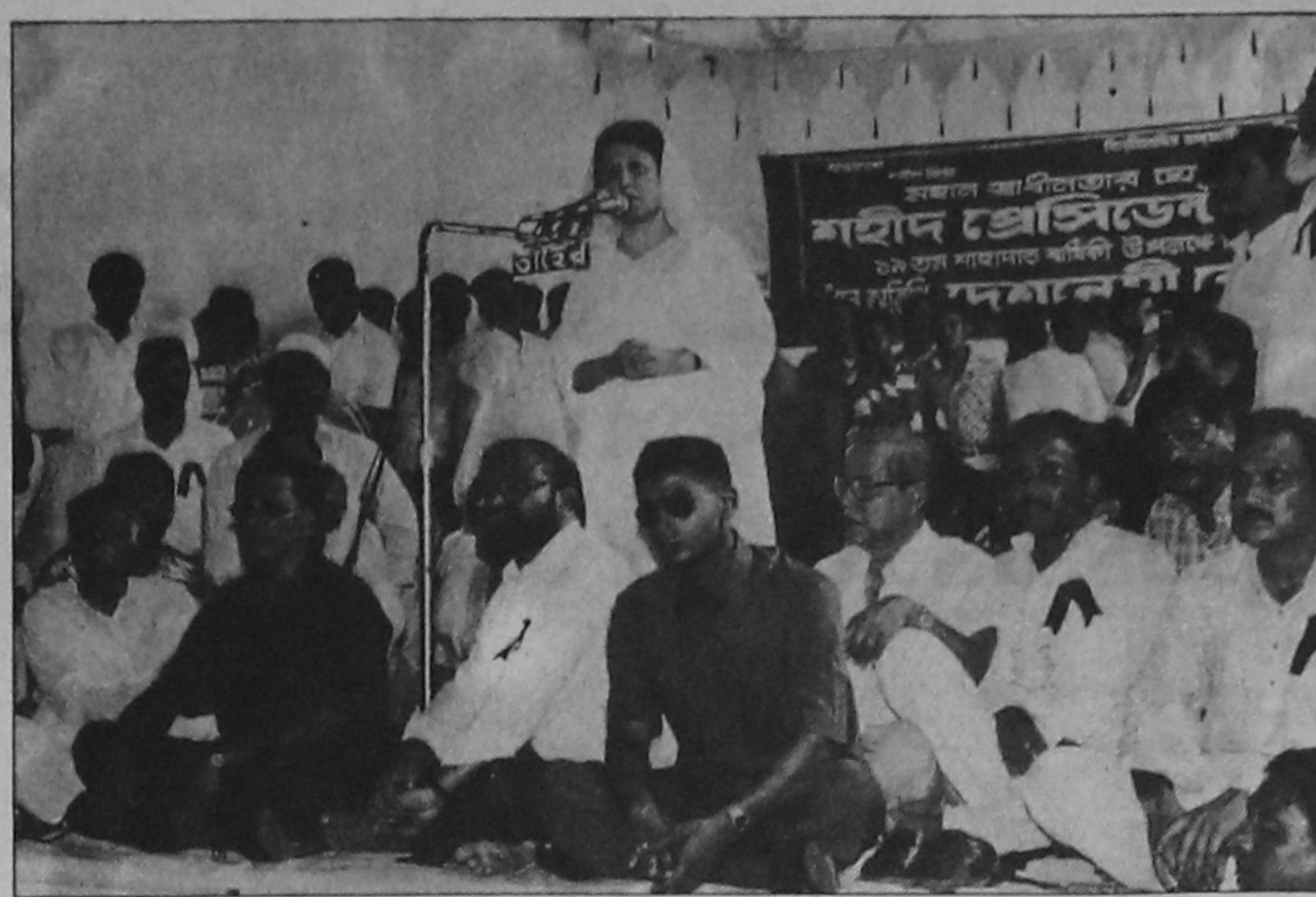
BNP chairperson and Leader of the Opposition in Parliament Khaleda Zia speaking at a discussion at Islampur in the city yesterday. Islampur Cloth Traders' Association organised the event to mark the 19th death anniversary of President Ziaur Rahman.