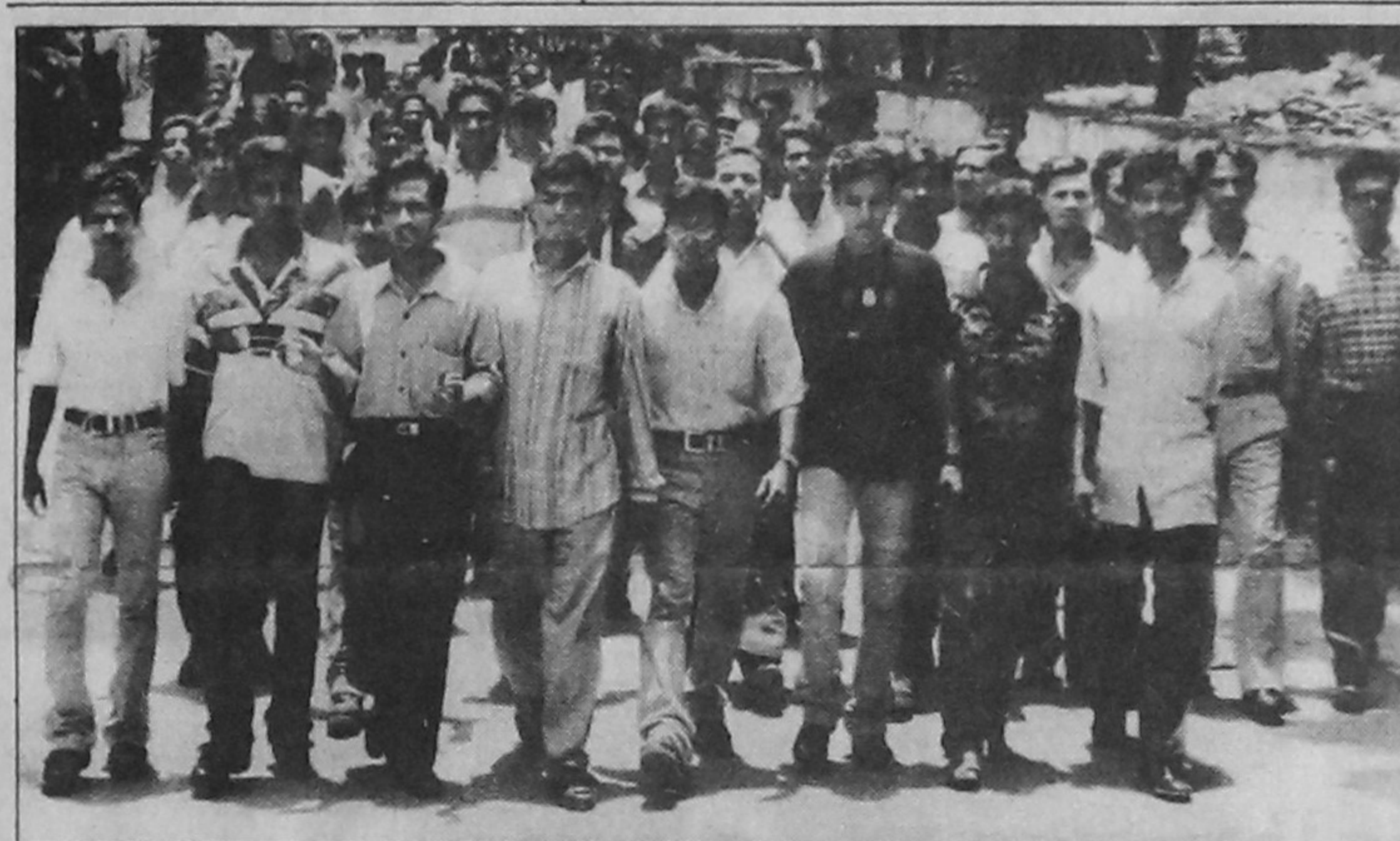
Jatiyatabadi Chhatra Dal brought out a procession on the Dhaka University campus yesterday to celebrate Bangladesh cricket's elevation to Test match status.

The KMCH is burdened with a loan of Tk 40 lakh, he said. Besides, doctors do not treat outdoor and indoor patients properly. Nurses, both male and female, have been extremely delinquent. Ward boys and sweepers are seldom found doing their duties, he said, terming the situation grave.