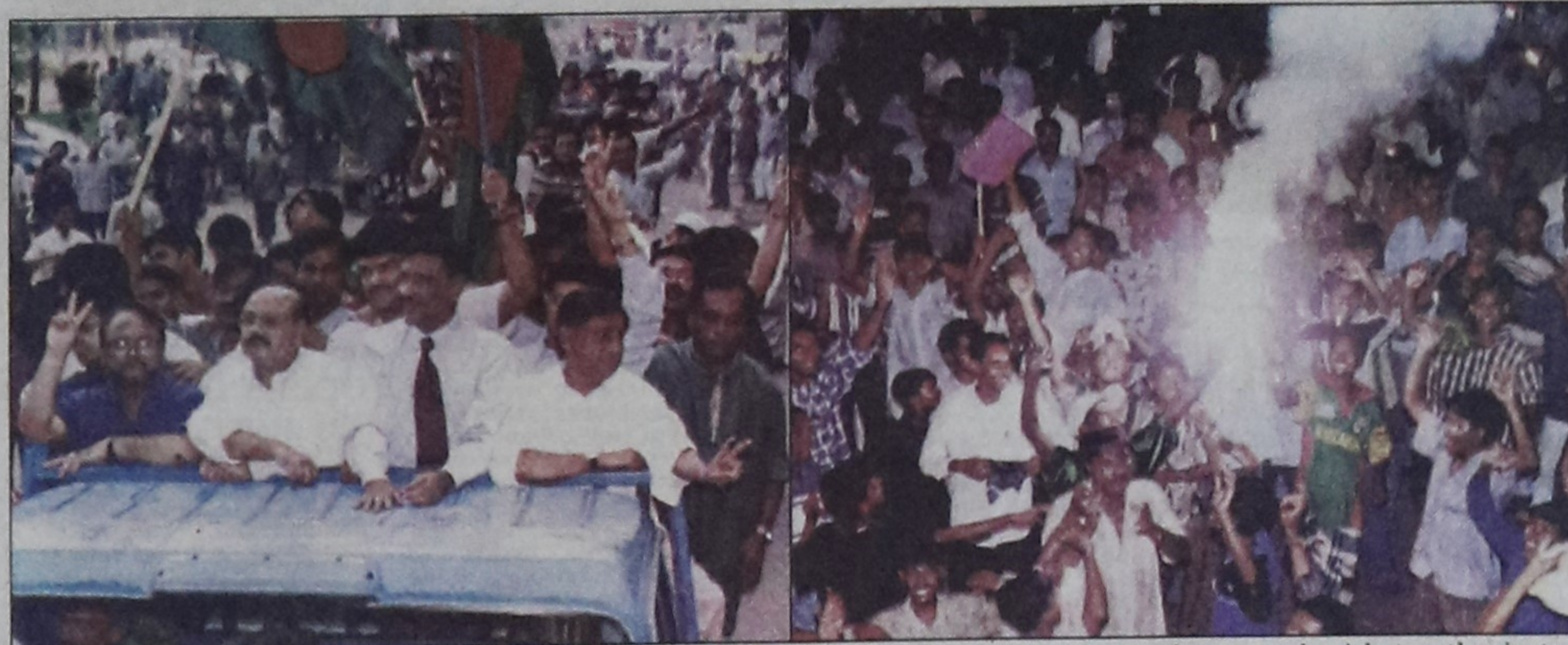
A time of celebration: Ministers, Awami League leaders, BCB officials, national team players and cricket enthusiasts ride round the Bangabandhu National Stadium on a truck after hearing Bangladesh's elevation to the Test club, and cricket crazy fans light some fireworks to celebrate the historic event yesterday evening.