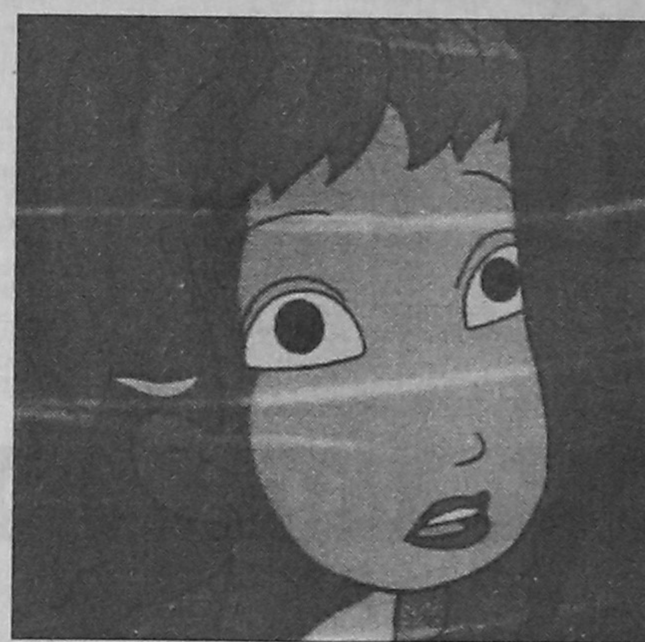
Animation show Jumanji on Ekushey at 7:20 tonight

6:00 BBC World News 6:30 Top Gear 7:00 BBC News/Asia Today Inc. World Business Report /24 Hours 7:45 Reporters 8:00 BBC News/Asia Today Inc. World Business Report 8:45 Reporters 9:00 BBC News Inc. World Business Report/Usa Direct/Asia Today /24 Hours 9:30 Asia Today 9:45 Reporters 10:00 BBC World News 10:30 World Living: Life- 11:00 Euro Brief 12:00 BBC World News 12:30 India Business Reports 1:00 BBC World News 1:30 Click Online (Pres-Stephen Cole) 2:00 World News 2:10 Correspondent- Europe 3:00 World News 3:30 HARDtalk 4:00 BBC World News 4:30 Top Gear 5:00 BBC The World Today 5:30 Correspondent- Europe 6:30 Face