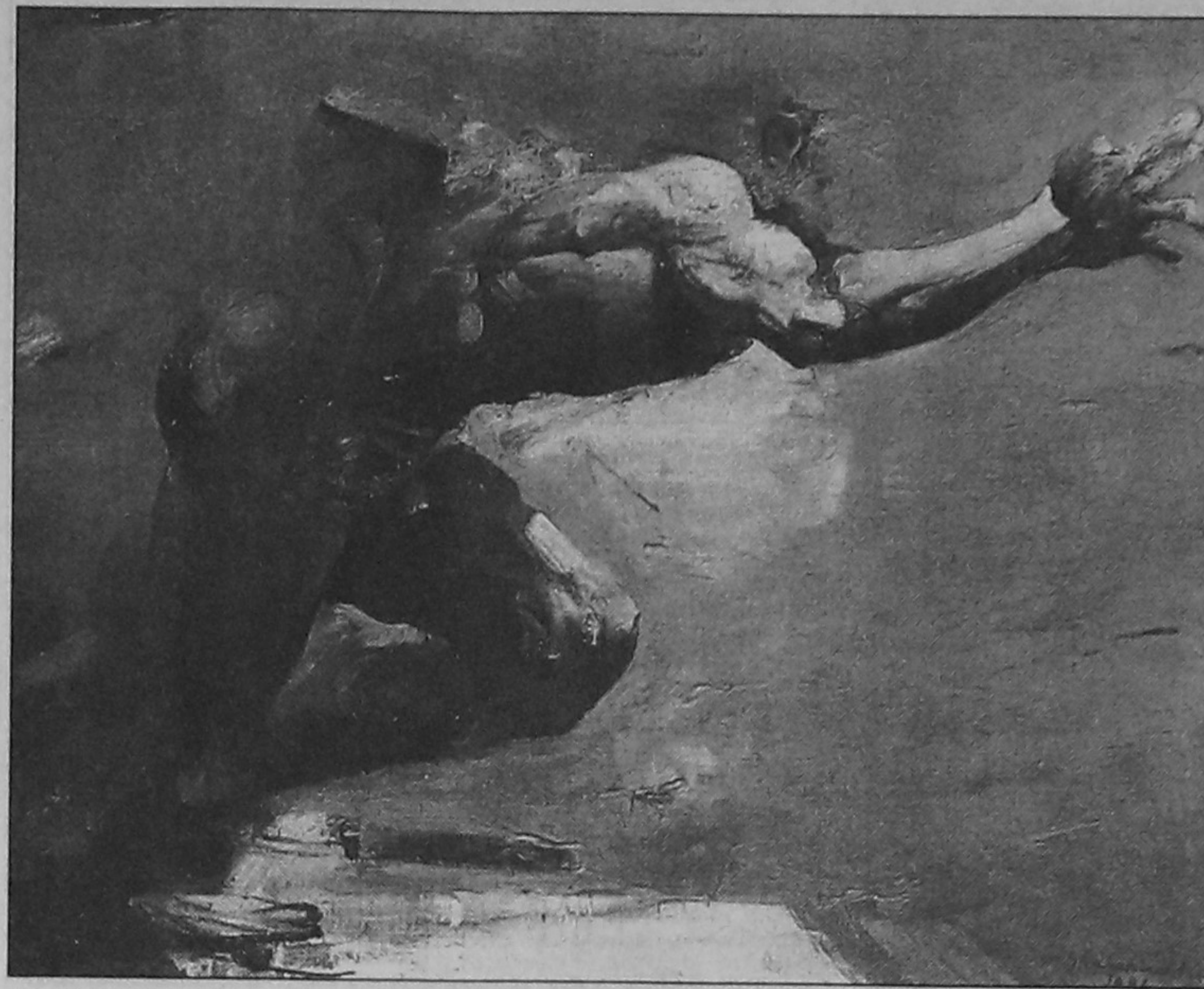
Shahabuddin, Freedom Fighter

market has only begun to expand in the country and some private entrepreneurs have come forward through establishing private art galleries in the city.