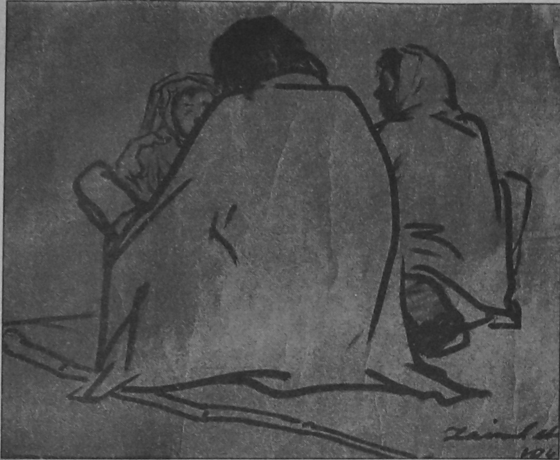
Zainul Abedin, Femine Sketch, ink

A survey of art market for Bangladeshi artists