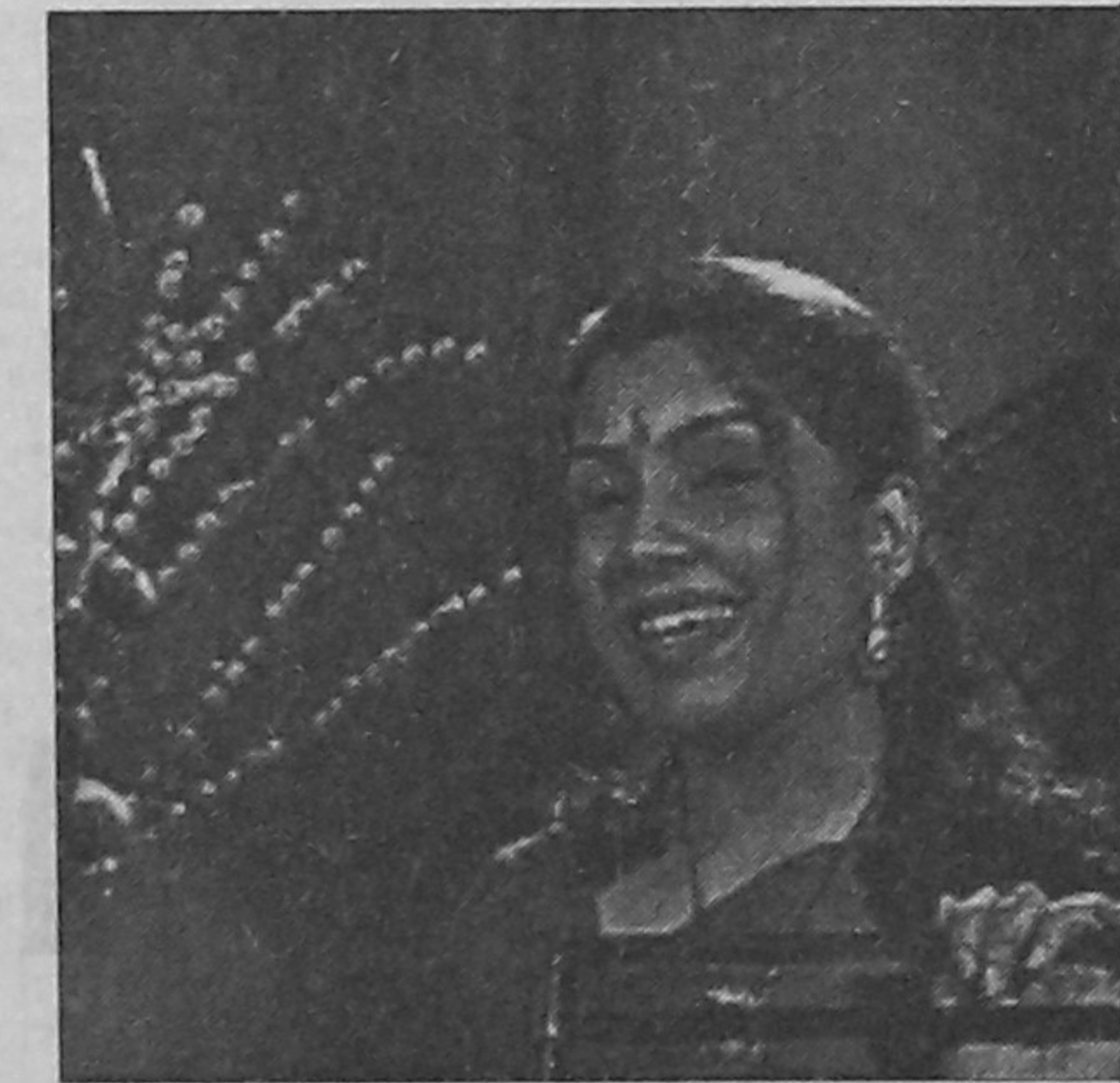
Chena Mukh Chena Sur on Ekushey TV at 10:20 tonight

7:30 Aalaap 8:00 Ta Ra Rum 9:00 Brake Hit 10:00 Old Is Gold 10:30 Hit Mix 11:00 Colgate Zig Zag Best of The Day 12:30 Sa Re Ga Ma Classic 1:30 Himani Gold T. Jharokha 2:00 Kumar Ajay Saree Prs Rangan Tarane