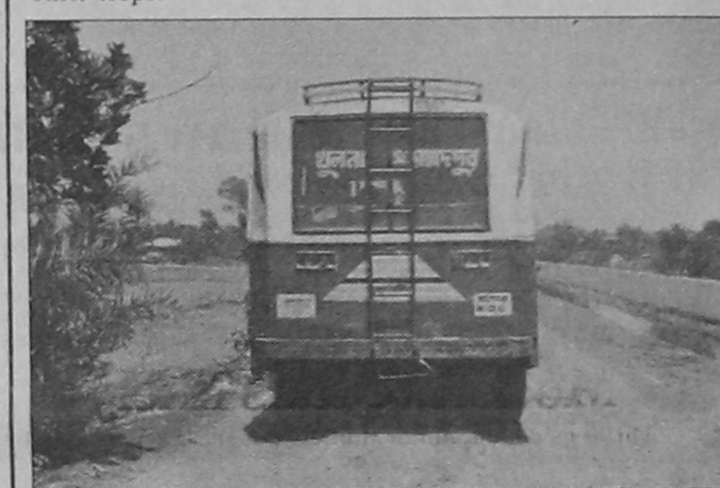
Risky road: Langalbandh-Magura road which runs via Sreepur is one of the important roads in Jhenidah and Magura districts. The road became unfit for traffic movement long ago. Though the road was repaired earlier, but it did not last due to faulty work. Photo shows a bus which is plying on the road at risk at village Goyaspur in Magura district.