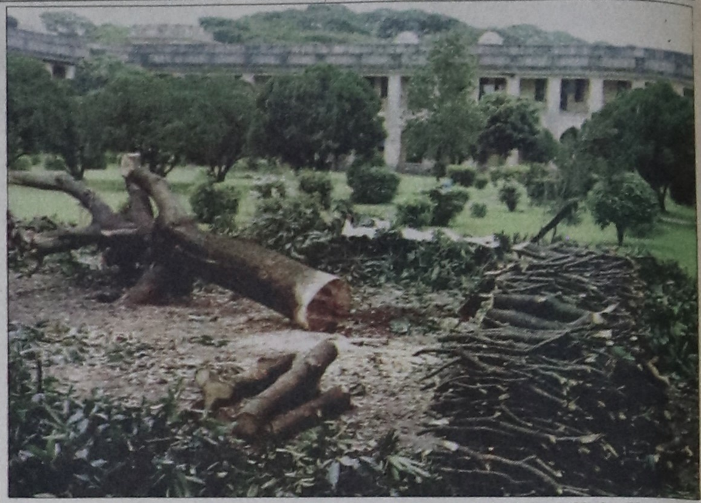
For sale? A mango tree lies at the inner lawn of Salimullah Hall of Dhaka University yesterday after it was sawed-off on Thursday night. But the reason for the felling could not be known immediately. Earlier, certain student leaders sold a number of trees of the hall.