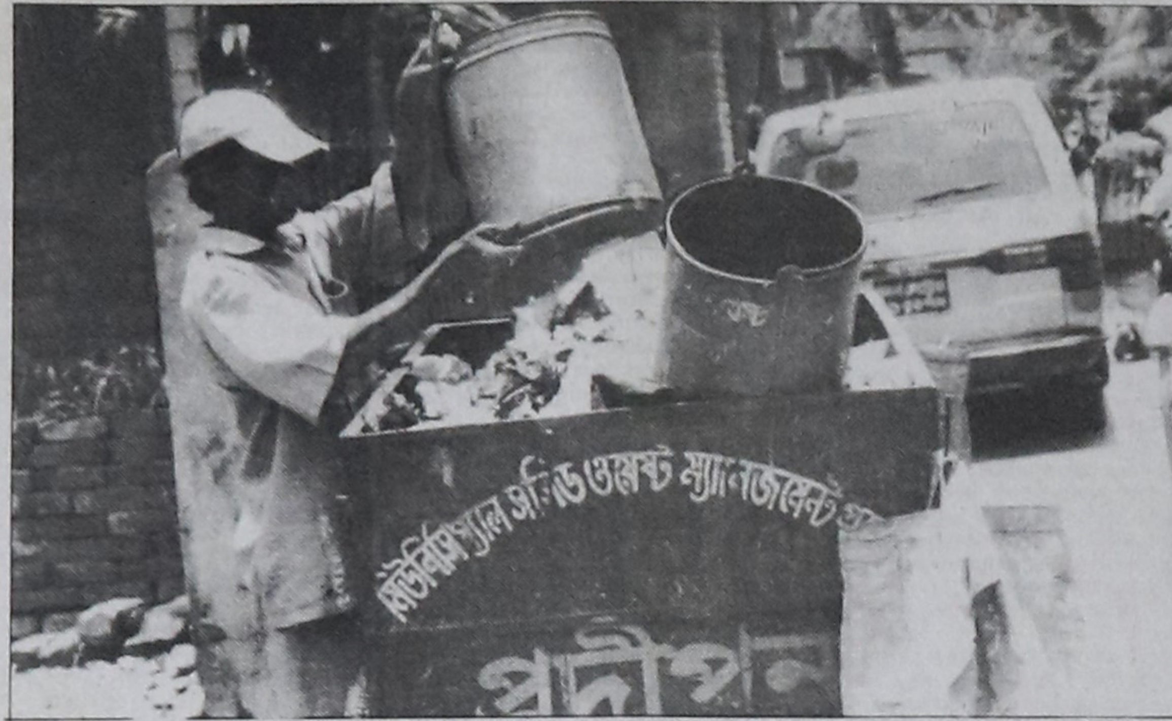
Clean choice: A community garbage collector empties a trash can into a rubbish bin at Dolkhola in Khulna. Prodipan, a local NGO, took the initiative that has gone a long way to help keep the neighbourhood clean.