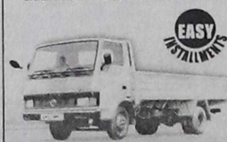
TATA LPT 509

Quick settlement of Insurance Policy through Nitol Insurance Co. Ltd. Warranty : 6 Months/20,000 k.m. Country's largest & most modern service centre at Tongi. Original parts at reasonable price. Guaranteed after sales service.