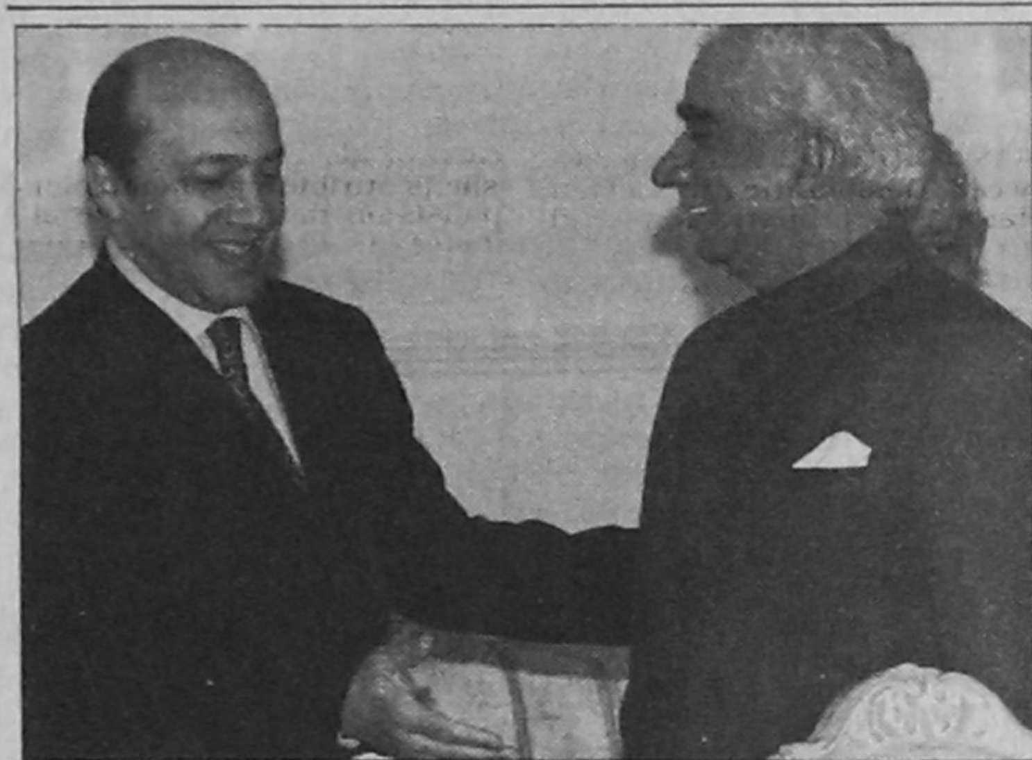
Russian Foreign Minister Igor Ivanov (L) invites his Indian counterpart Jaswant Singh (R) to take a seat during their meeting at the Russian Foreign Ministry in Moscow yesterday. Singh arrived in Moscow to prepare the official visit of Russian President Vladimir Putin to India this autumn.

Singh, on a four-day trip to Moscow to prepare for the Russo-Indian summit -- Putin's first official visit to the Indian sub-continent -- was to hold talks with the Russian president later in the day.