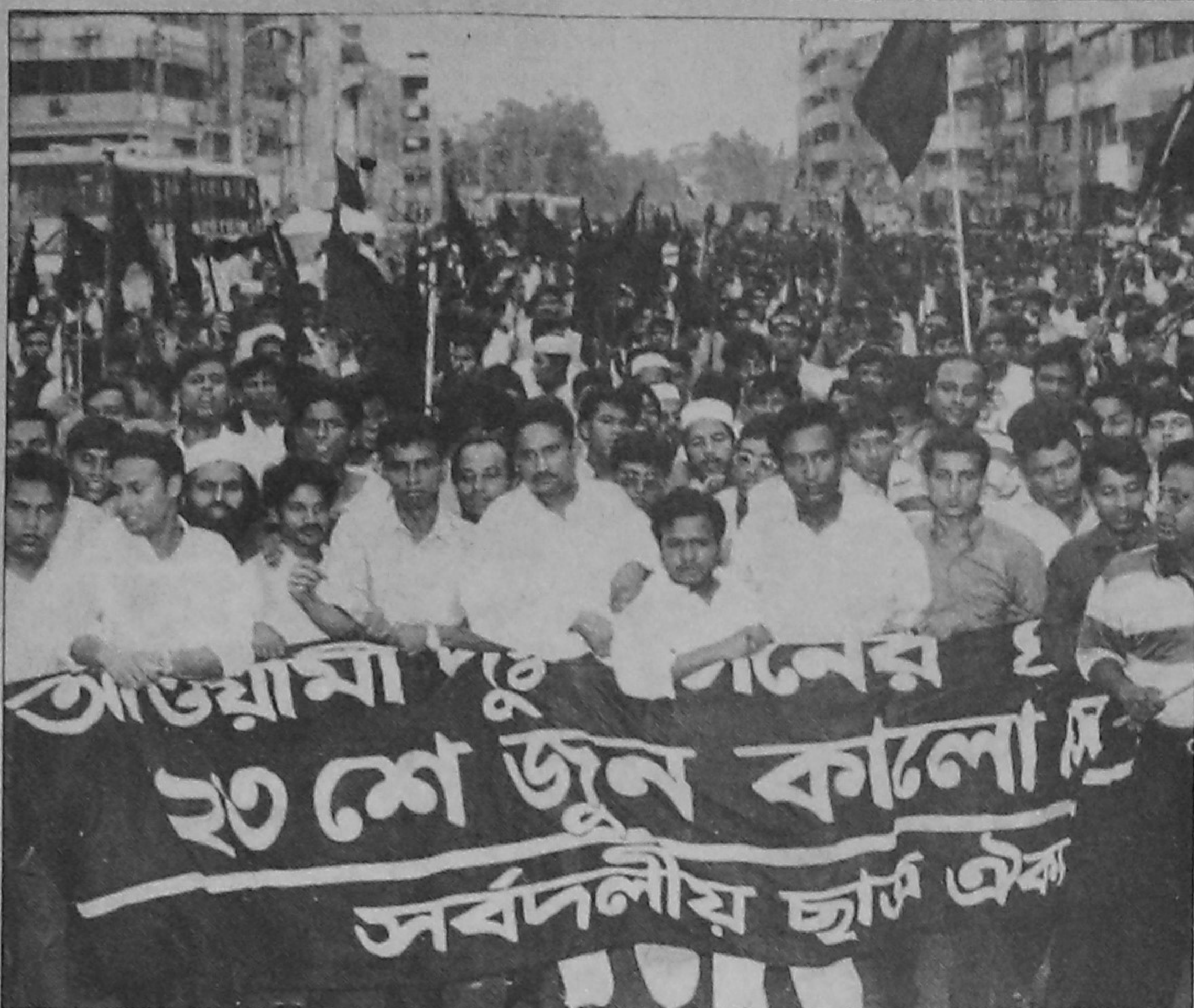
All Party Students Unity (APSU) brought out a procession from the BNP office in the city yesterday declaring the day (June 23) as Black Day to protest 4 years of misrule by Awami League.