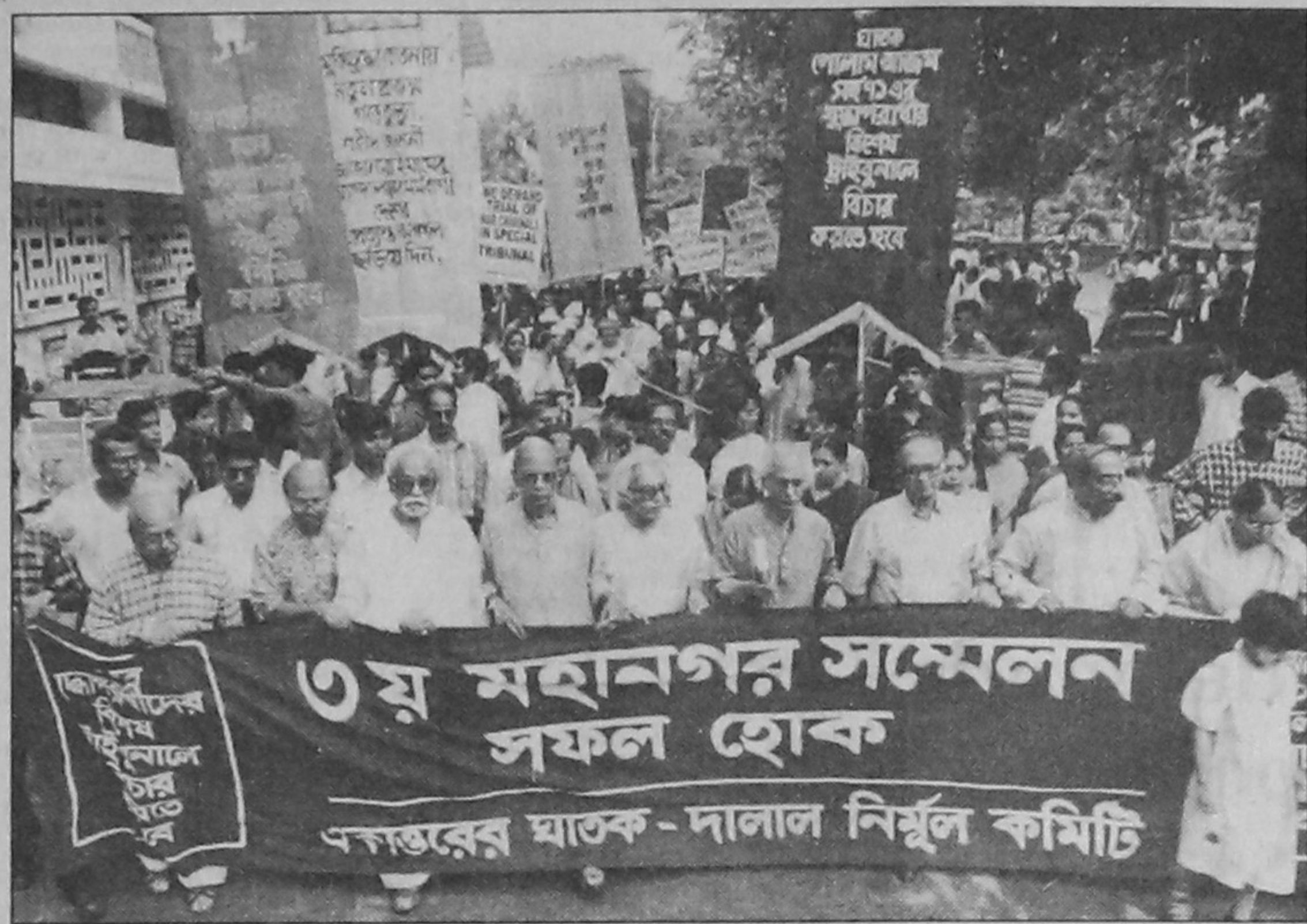
Ekattarer Ghatak Dalal Nirul Committee (Committee for Annihilation of the Collaborators of the '71) brought out a procession in the city yesterday on occasion of their 3rd metropolitan conference.

Col Mohammad Masud has been sent to Sylhet Medical College Hospital and Col M Zillur Rahman to Chittagong Medical College Hospital on deputation.