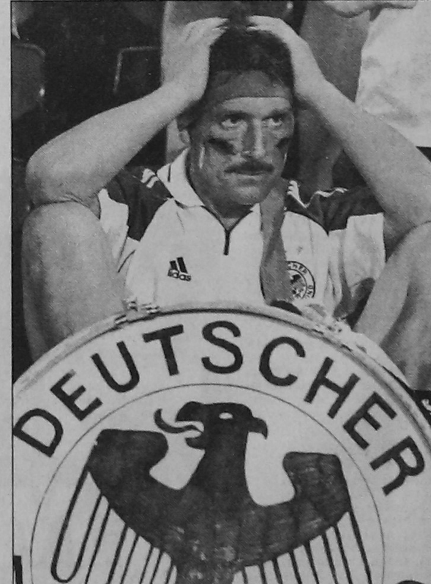
THE EAGLE HAS CRASHED: A crest fallen German fan coming to terms with his team's elimination from the Euro 2000 at Rotterdam on June 20. In front of his is a drum with the German national insignia of an eagle.

GEEL, Belgium, June 21: Italy captain and defender Paolo Maldini, who injured his knee in Monday's 2-1 victory over Sweden, will be back for his side's quarter-final match in Brussels on June 24.