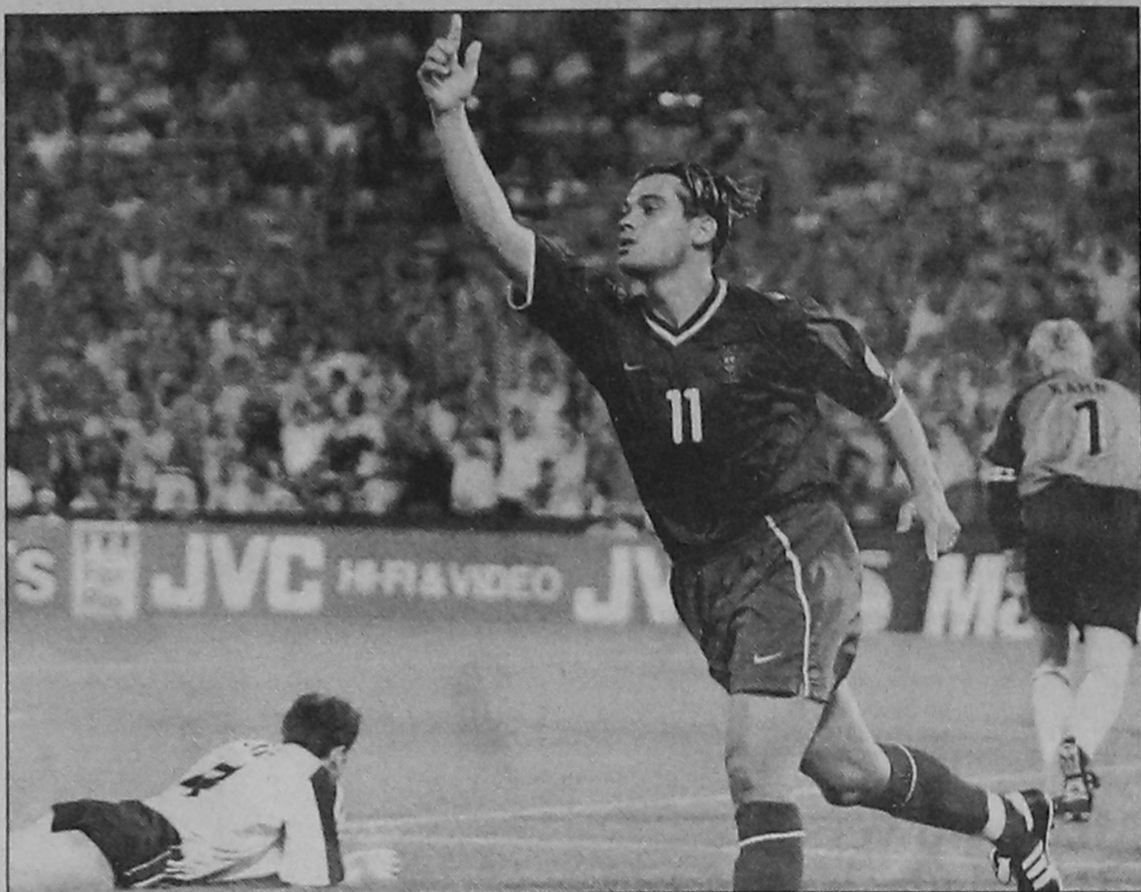
HAIL CONCEICAO: Portugal's Sergio Conceicao exults after completing his hat-trick against Germany at Rotterdam on June 20.

ROTTERDAM, Netherlands, June 21: A Sergio Conceicao hat-trick earned Portugal an emphatic 3-0 victory over Germany here on Tuesday despite fielding their second string having already qualified for the Euro 2000 quarter-finals.