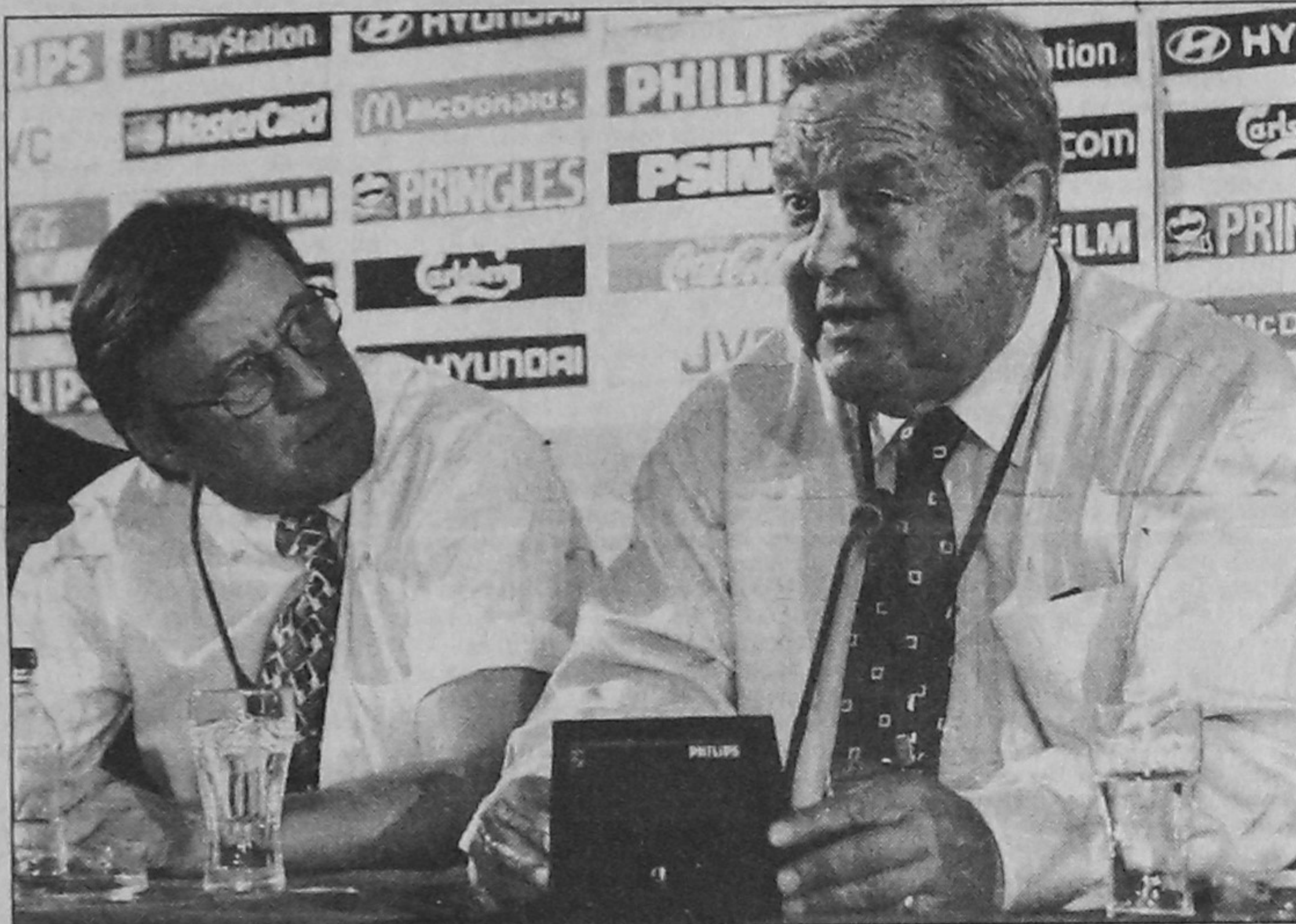
UEFA president Lennart Johansson (R) talks to reporters while his chief executive Gerhard Aigner listens in Liege, Belgium on June 18. UEFA has threatened England that they would be thrown out of Euro 2000 if they had not taken care of their trouble-making supporters.

With more questions than answers the BKSP, which has enjoyed its best days during the Ershad regime, is heading for a crash in the long run. With the rapid increase of private coaching clinics (a recipe for disaster), especially in cricket, BKSP with its current philosophy faces a threat of completely losing its already delicate image.