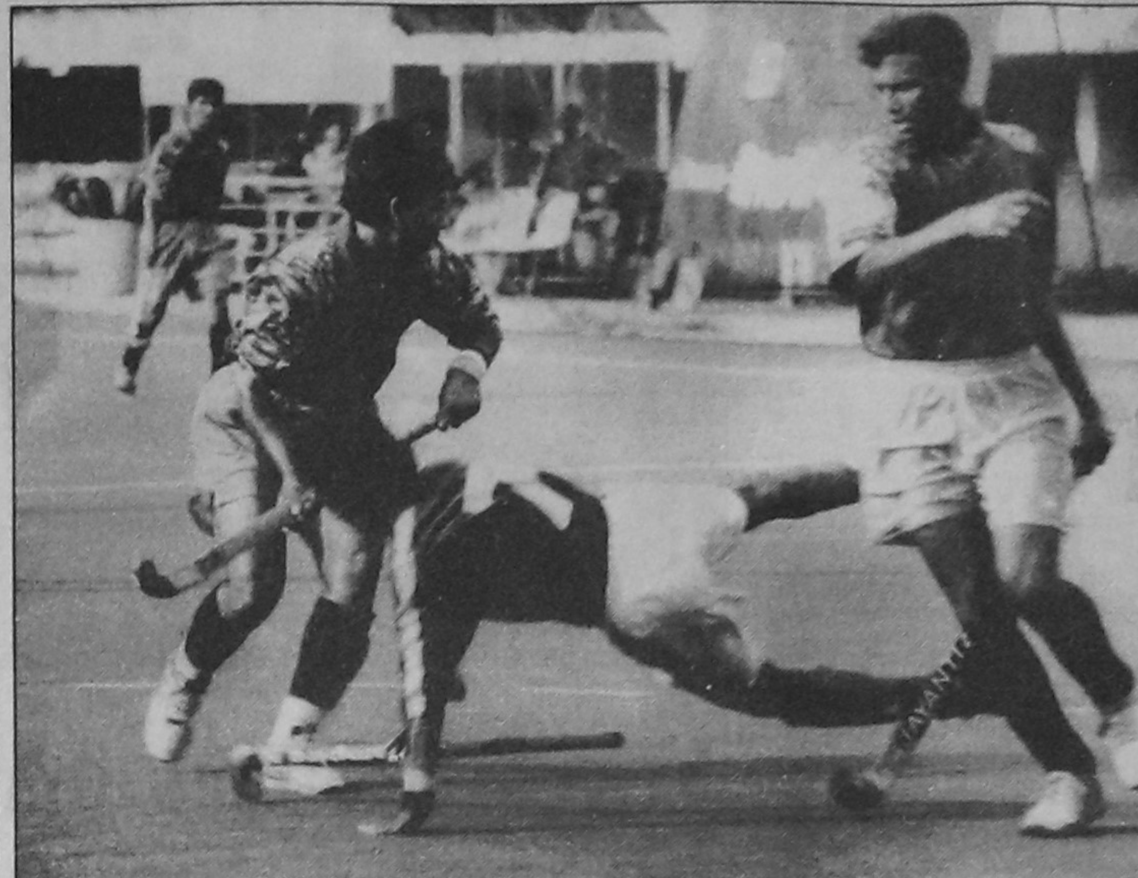
Action from the Ragib Ali Gold Cup hockey tournament encounter between Sonali Bank and Bangladesh Railway at the Moulana Bhasani Stadium yesterday.

He remained in a coma for twenty days at the intensive care unit of Bangabandhu Medical University.