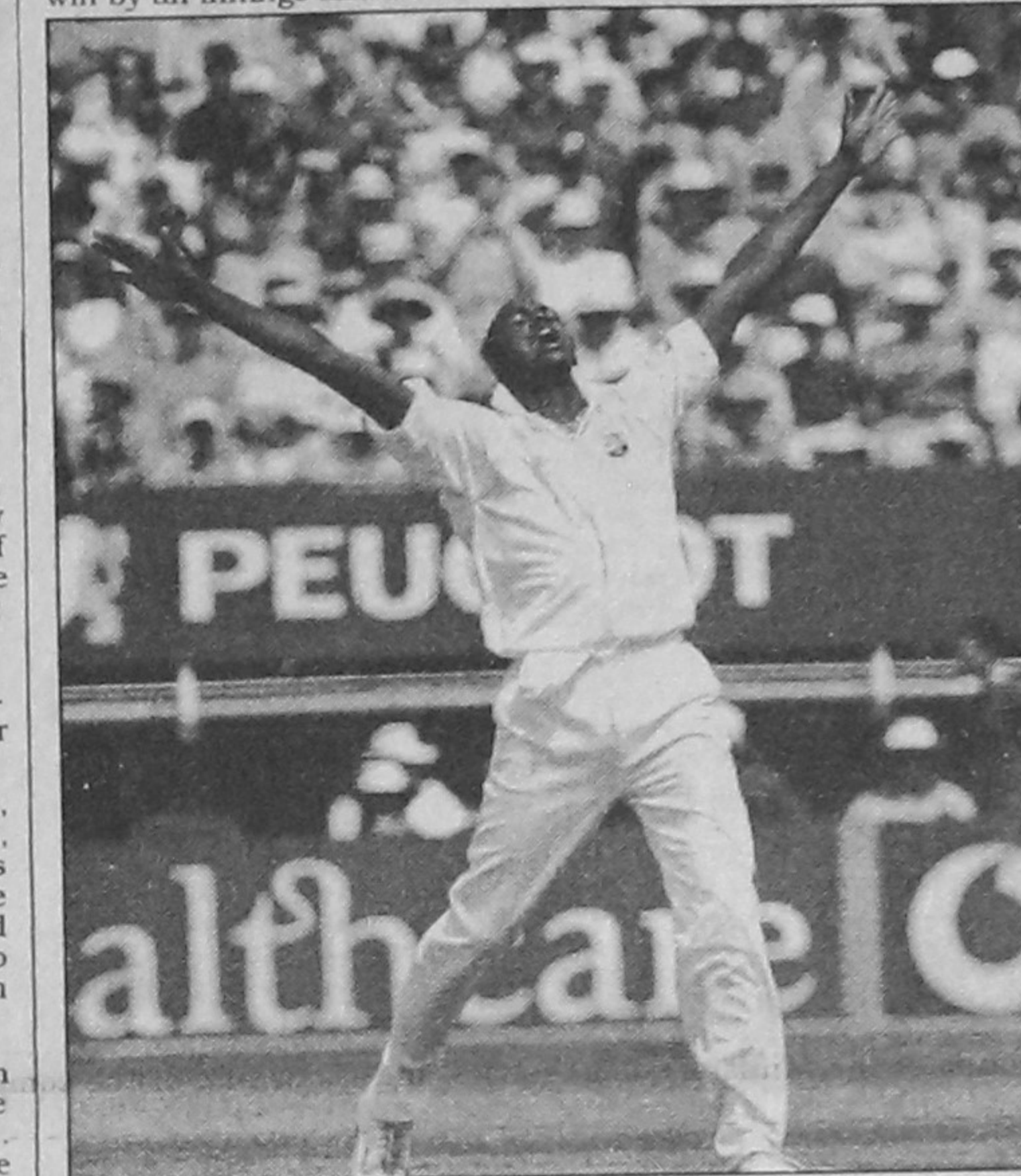
AGELESS WONDER: West Indies paceman Courtney Walsh exults in familiar fashion after dismissing England opener Mark Ramprakash for a duck on the third day of the Edgbaston Test on June 17.

Adams looked after the strike in expert fashion. See page 15