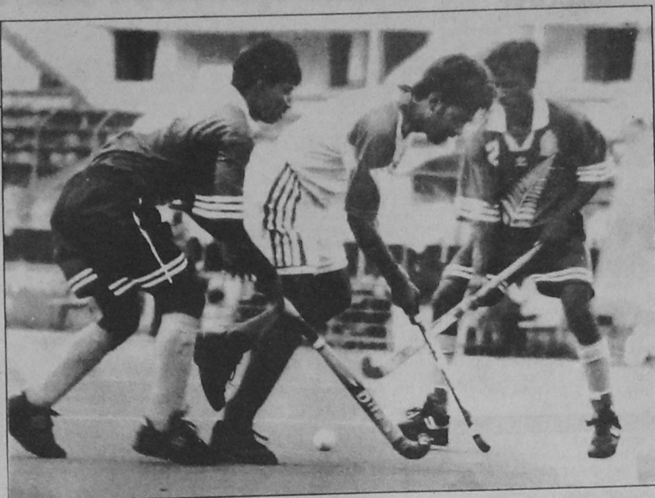
Action from yesterday's Ragib Ali Club Cup hockey tournament encounter between Victoria Sporting Club and Ajax SC at the Moulana Bhasani National Stadium.