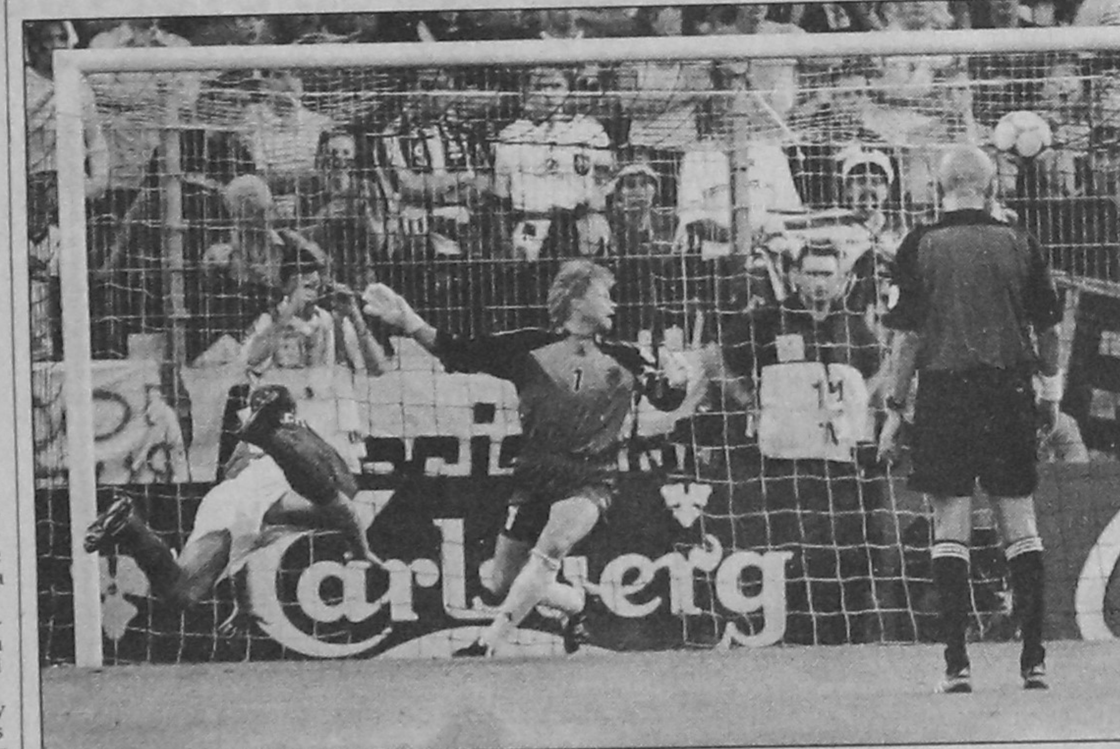
NO GOAL TASTES SWEETER: Alan Shearer (L), the veteran England striker is airborne while his header finds the back of the German net at Charleroi on June 17.

The Germans will have their chance to take revenge when the two teams meet October 7 at Wembley in a qualifying match for the 2002 World Cup.