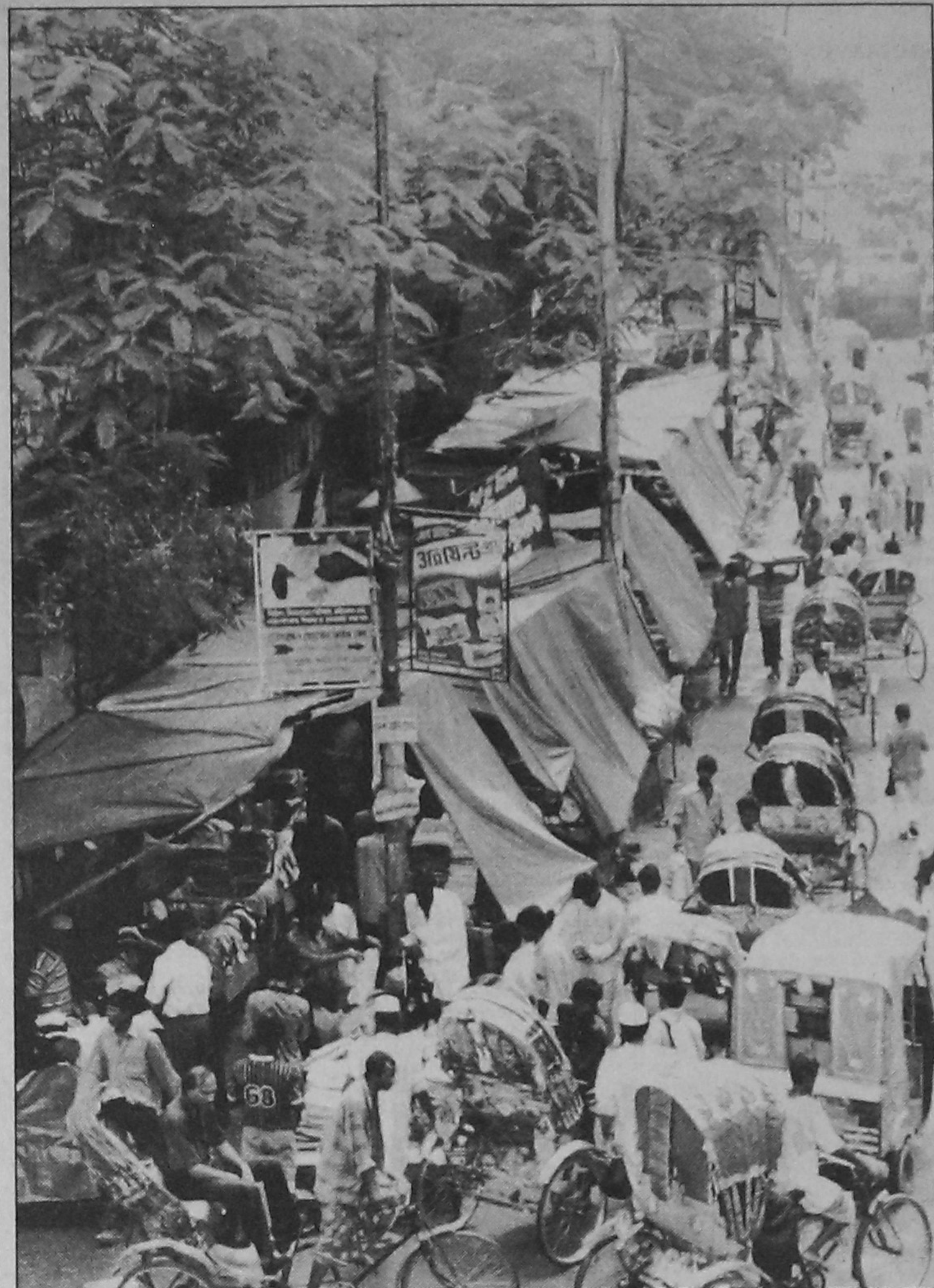
The walkway near the Paltan Crossing in the city has been besieged by hawkers, and the pedestrians and the authorities do not seem to mind. Or do they?

Rawabdeh's 15-month old cabinet has been accused by liberal and conservative politicians alike of nepotism in appointments to senior jobs in the coveted civil service and of graft and abuse of public funds.