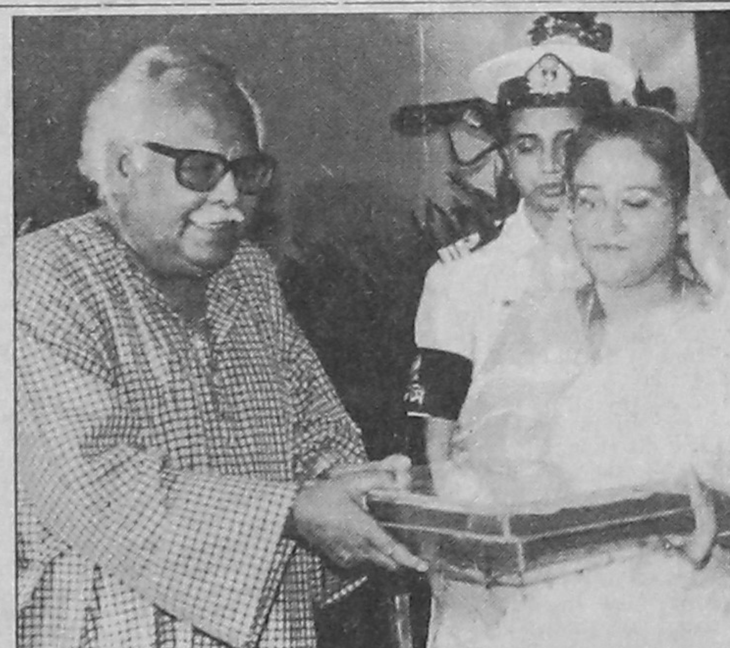
MR Akhtar Mukul handing over the scripts and the book of Charampatra to Prime Minister Sheikh Hasina for preservation at the National Museum at a function yesterday.