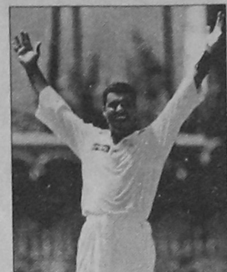
WAQAR... 300 wkts

Courtney Walsh of West Indies with 454 wickets in 86 Tests, Kapil Dev of India with 434 wickets in 131 Tests and Sir