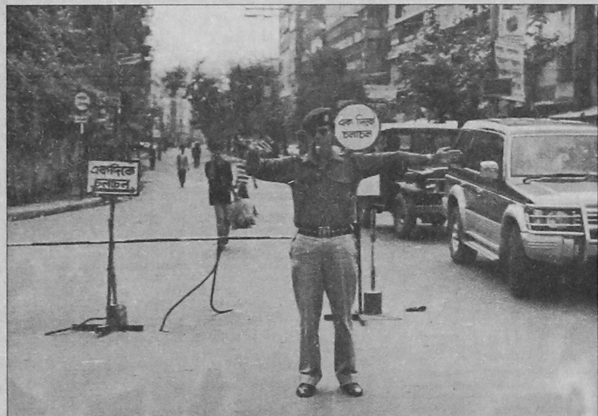
Enforcing the 'one-way' at Kudrat-e-Khuda (New Elephant) Road, a police officer directs traffic from the east to the west yesterday. DMP traffic division enforced the decision without any public notification earlier.

West Indies were 289 for six, a lead of 110, one hour after the tea on the second day of the first Test against England at Edgbaston yesterday. Captain Jimmy Adams was not out on 56 while Curtly Ambrose was at the other end with 22.