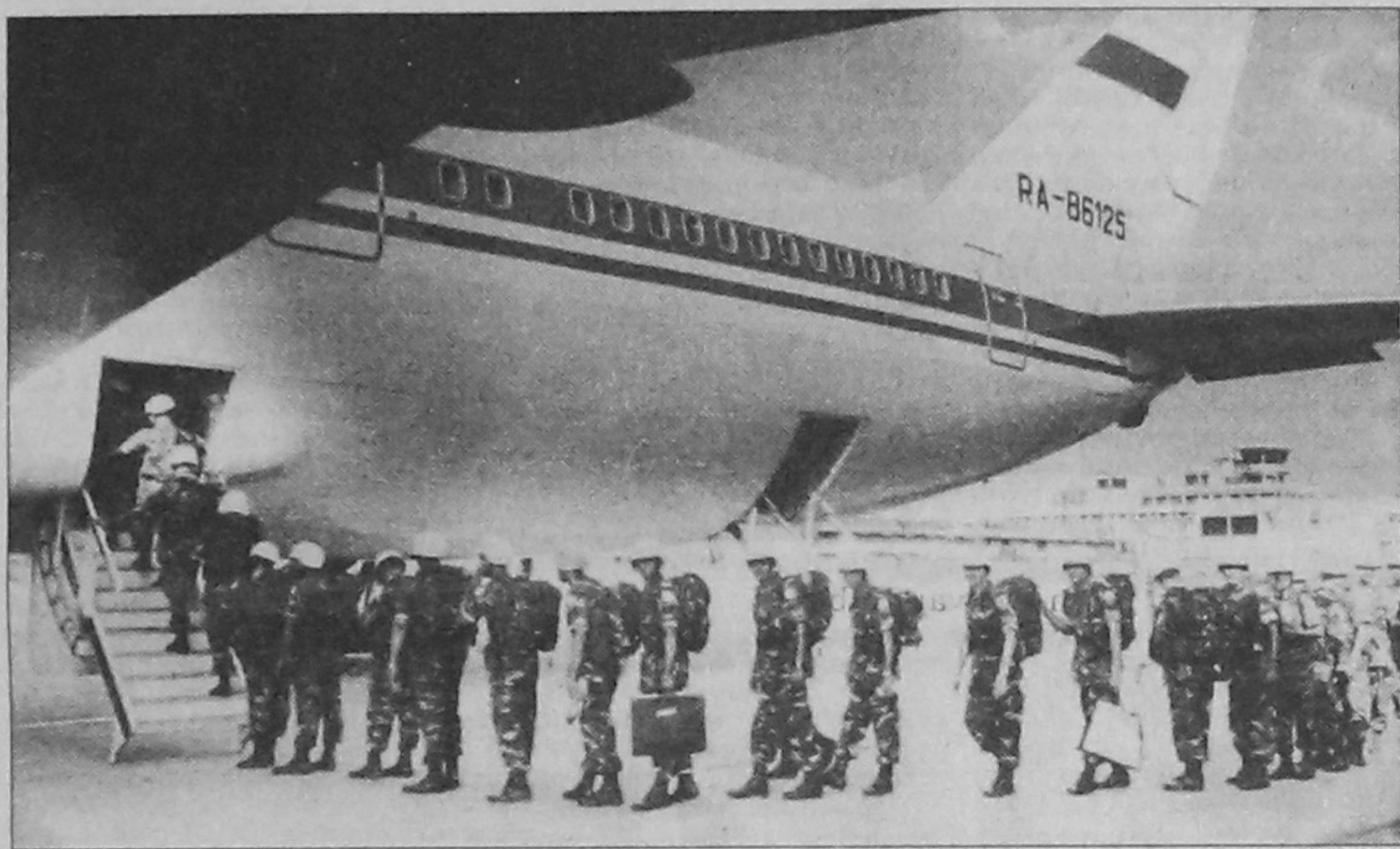
The last batch of the Bangladesh Battalion (BANBAT) in the United Nations Assistance Mission in Sierra Leone (UNAMSIL) left Dhaka yesterday.