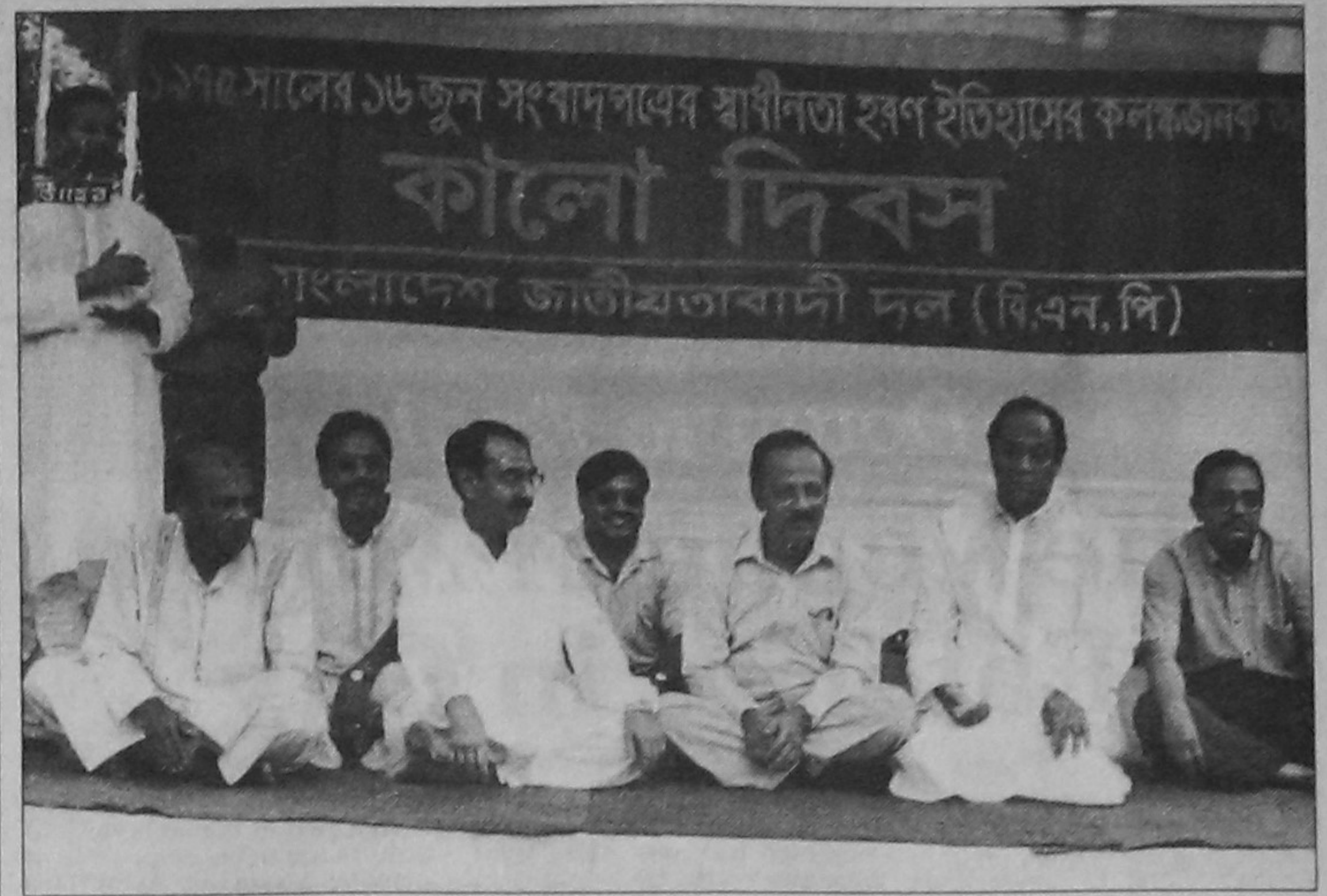
BNP observed 'Black Day' yesterday to mark the closure of most newspapers in the country in 1975.