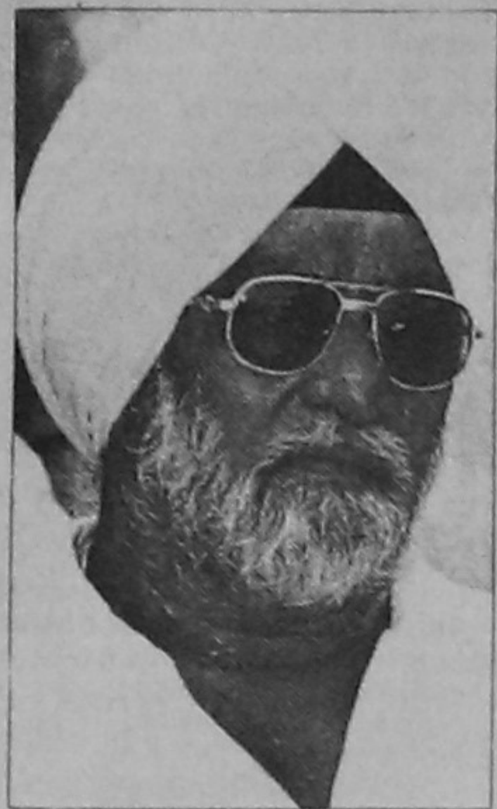
Bishan Singh Bedi (Former Indian captain)

"I don't know. I am not an expert. It is for the administration to decide. The ball is in their court. They must come clean."