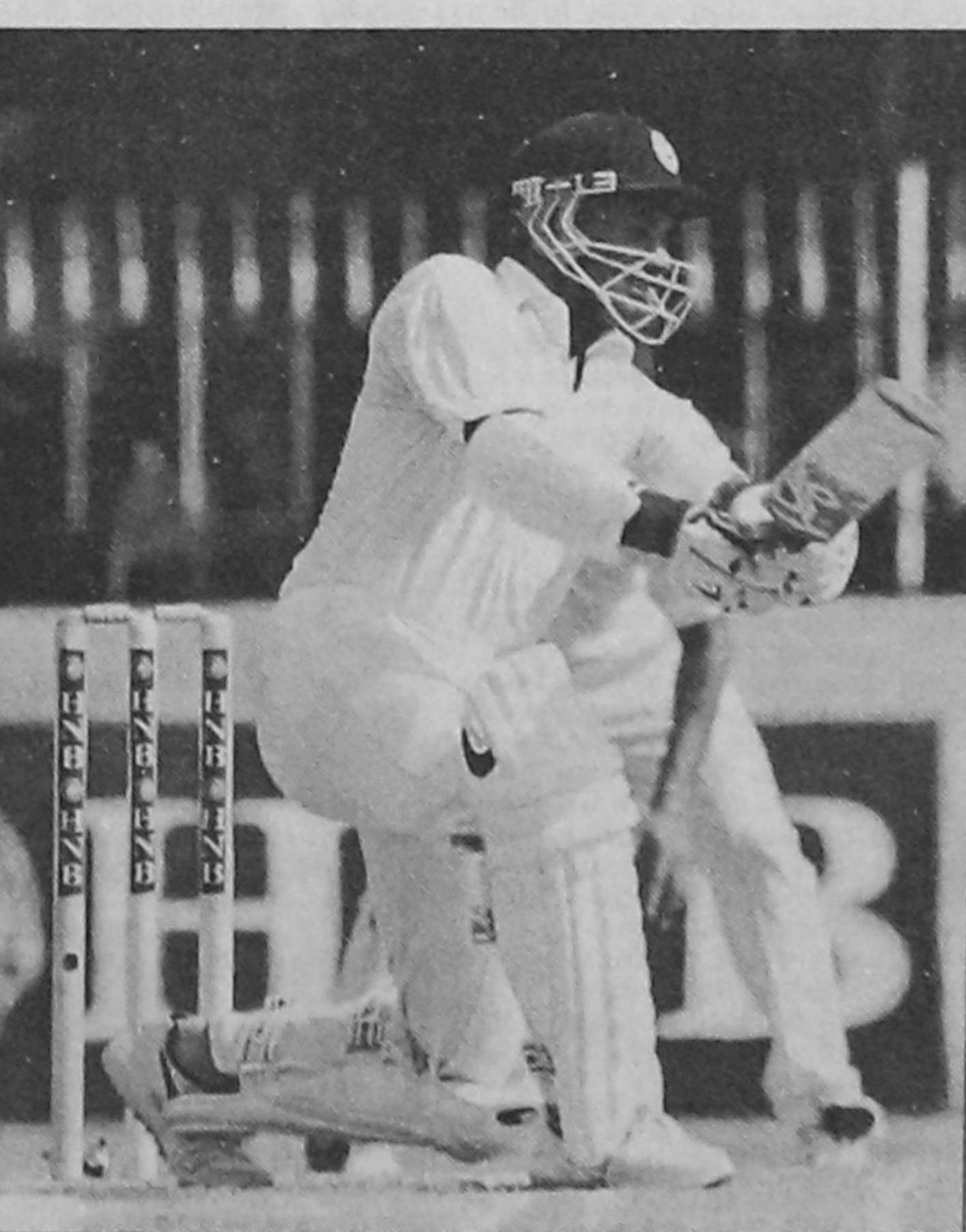
Sri Lanka skipper Sanath Jayasuriya follows through on a square-drive on the opening day of the first Test against Pakistan at Colombo yesterday.