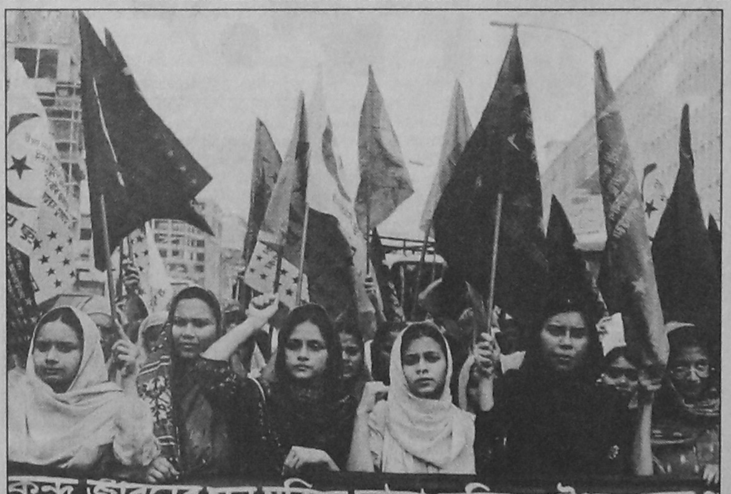
Female Student Front of National Sunni Movement yesterday brought out a colourful procession in the city on the occasion of holy Eid-e-Miladunnabi today.

From page 1 security reason. Musclemen often tease them on way to the wards. They also demand tolls from attendants of patients. The Khulna Metropolitan Police has not so far provided no security for the staff and the patients despite related appeals, said a KSH official.