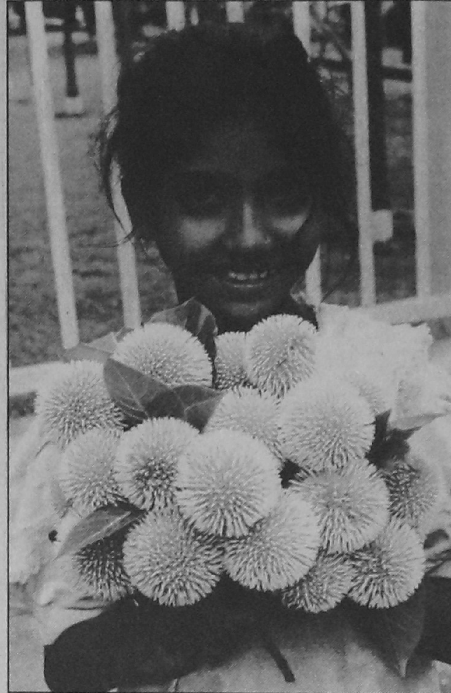
Bristled beauty: Her face glowing just as the hadam flowers she holds, a teenager stands on a city road yesterday hoping to do some brisk business ahead of the first day of Ashar, the Bengali month that traditionally marks the dawn of the rainy season, which is today.

The district JCD brought out a procession and held a brief rally at the Court Point today.