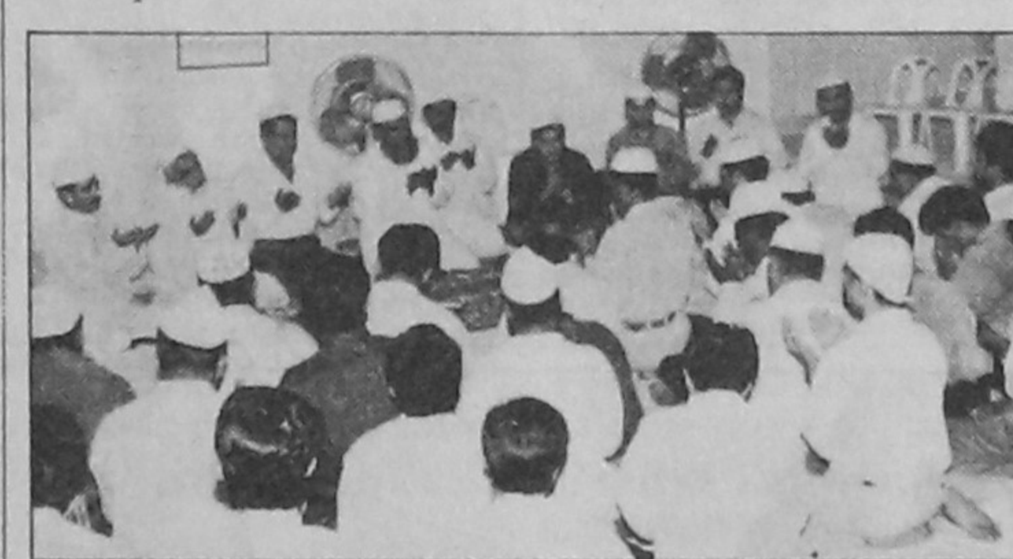
A milad and doa mahfil was held by Far East Islami Life Insurance Company Ltd at its premises at Motijheel C/A yesterday to mark the launching of its Islami Life Insurance scheme.