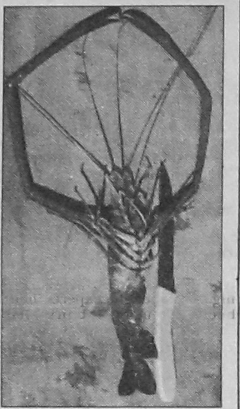
A sample of small size Golda shrimp