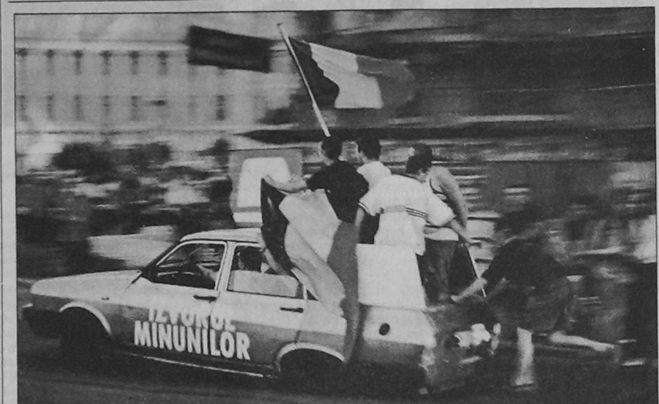
DRAW SUITS 'EM FINE! Residents of the Romanian capital Bucharest celebrating their national squad's 1-1 draw against Germany in the Euro 2000 on June 12.

And a superb performance by Andersson in their final two group games can only be good for a Swedish side needing character by the bucket loads if they want to continue past the pool stage in this tournament.