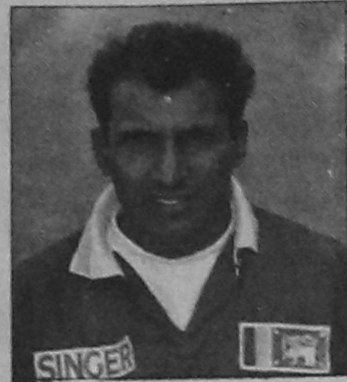
Aravinda de Silva

(Sri Lanka's master batsmen) "I want to be remembered as a run-scoring and successful batsman and want to go on while I'm fit enough to play and to perform."