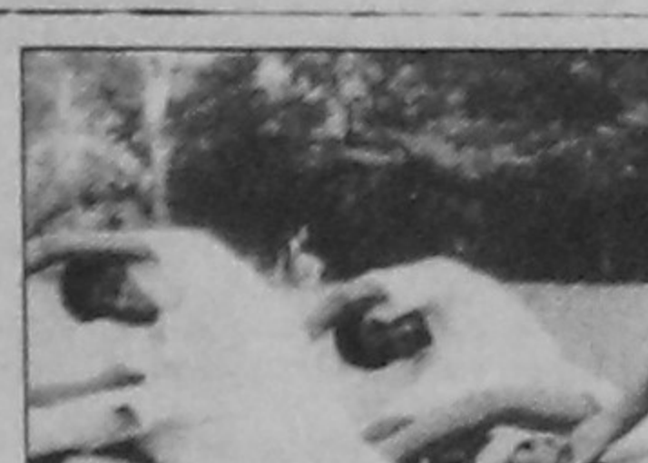
Bangladesh under-17 cricketers doing some stretching during a practice session at the BUET ground yesterday. The team is to take part in the Asian Under-17 Championship to be held in Karachi from July 15.