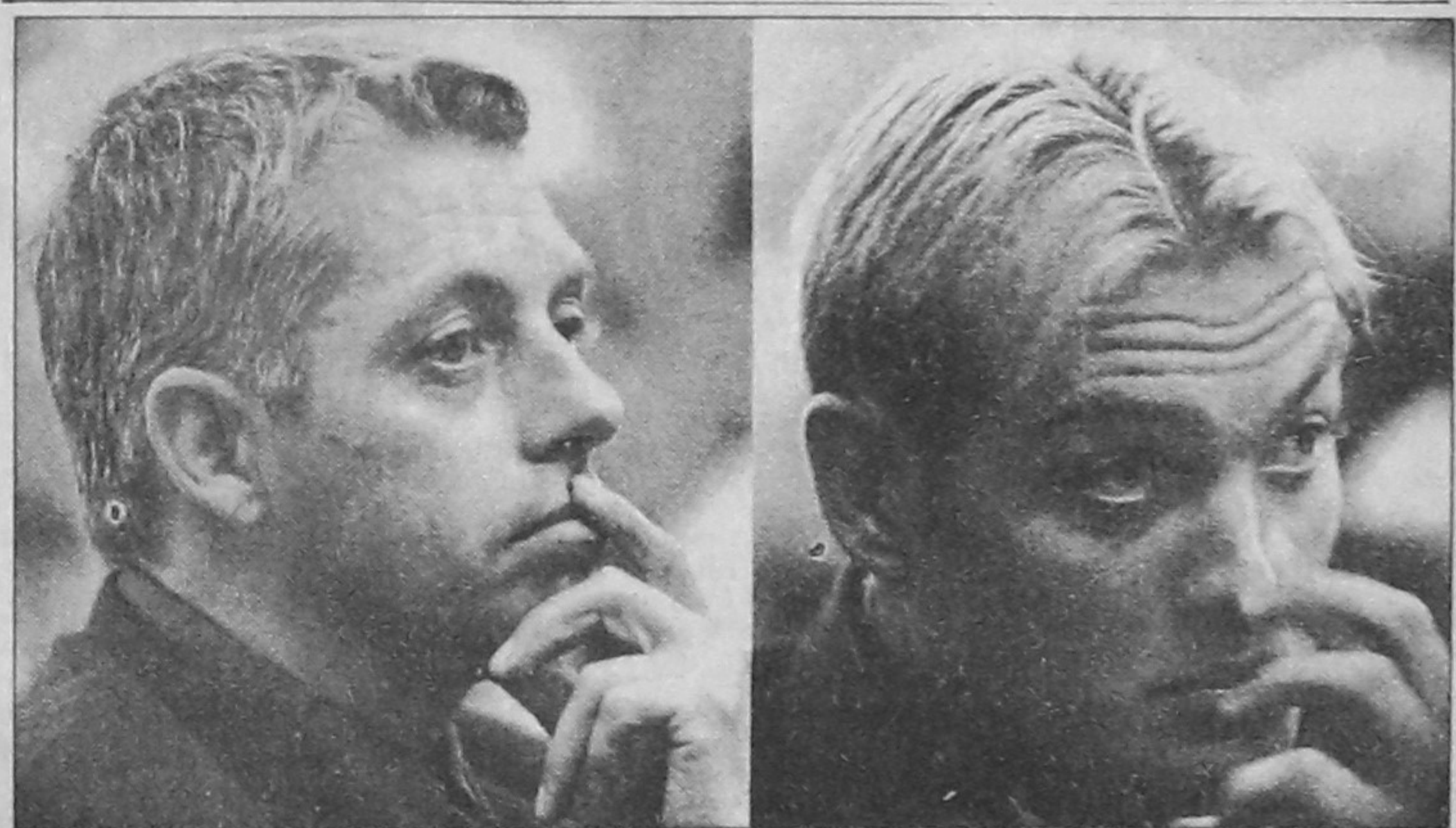
South Africans, former wicketkeeper Dave Richardson (L) and all-rounder Jacques Kallis during the King Commission hearing in Cape Town yesterday.

Bangladesh under-17 cricketers doing some stretching during a practice session at the BUET ground yesterday. The team is to take part in the Asian Under-17 Championship to be held in Karachi from July 15.