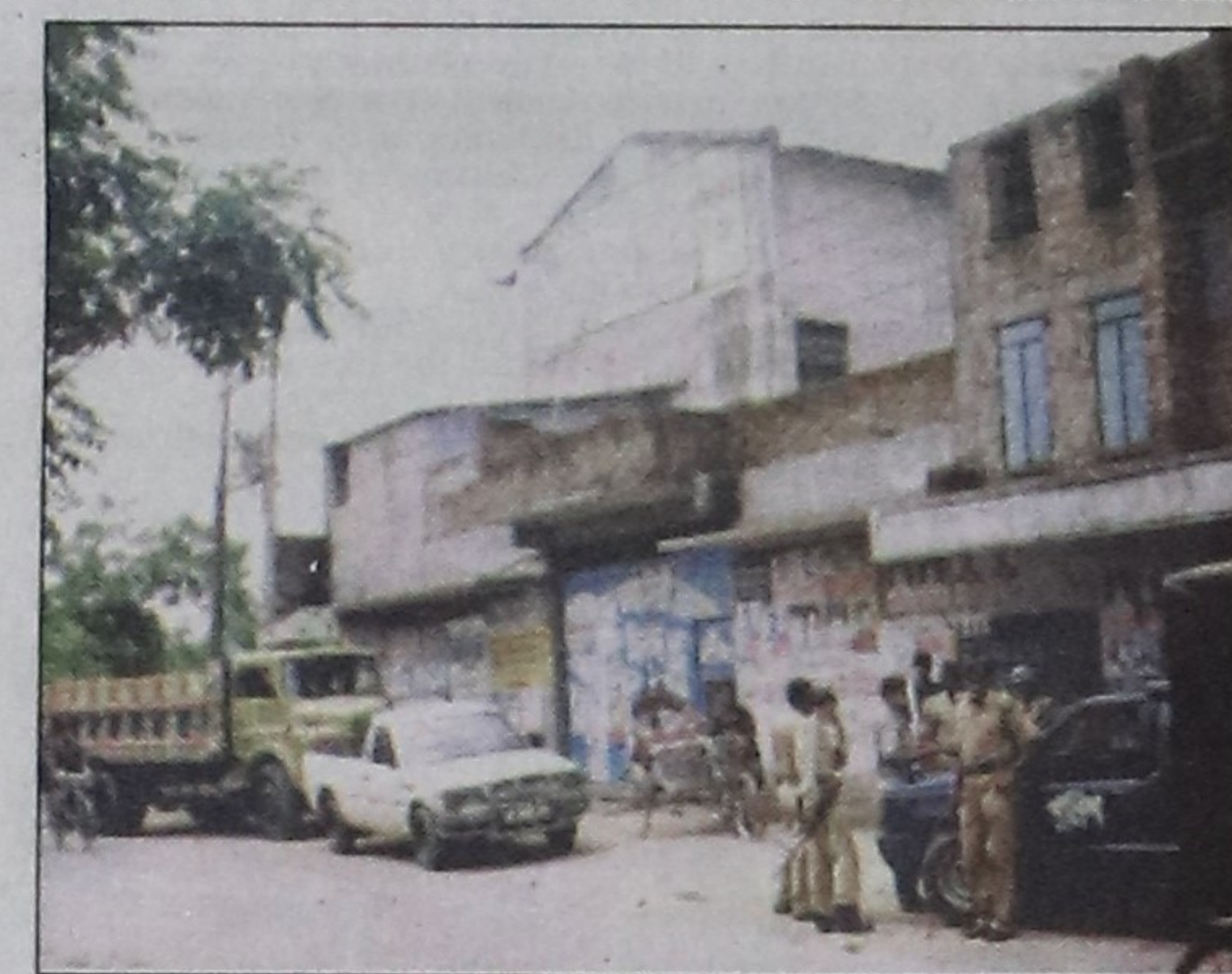
Police guarding Ajmiri Flour Mill in Sirajganj town after a clash between two groups over ownership of the mill yesterday.

A case was filed in connection with the clash.