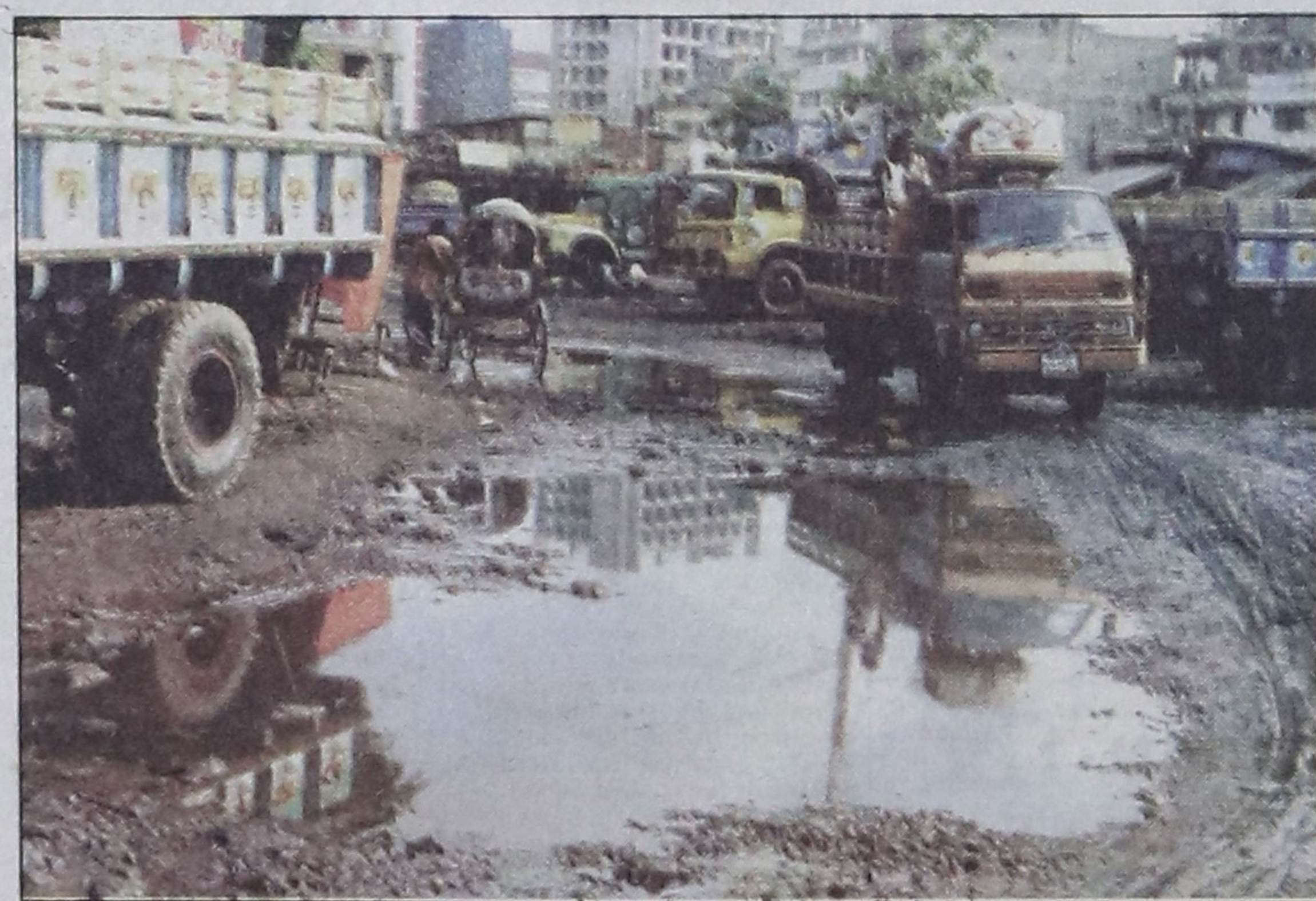
The run-down road in front of Tejgaon Railway Station has failed to catch the attention of the authorities.