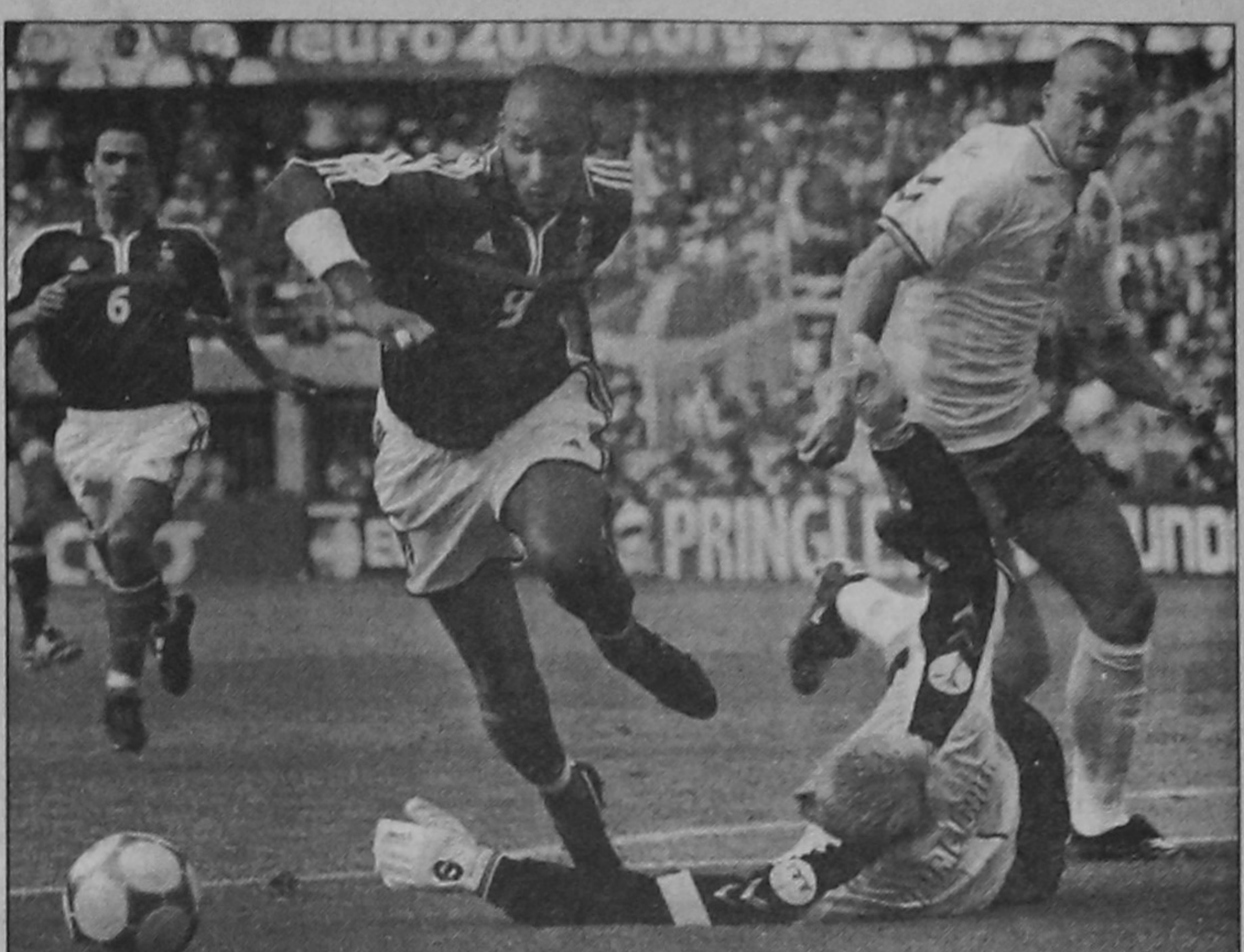
Nicolas Anelka, the French striker, going past the out stretched hand of Danish custodian Peter Schmeichel during their Euro 2000 fixture on June 11.