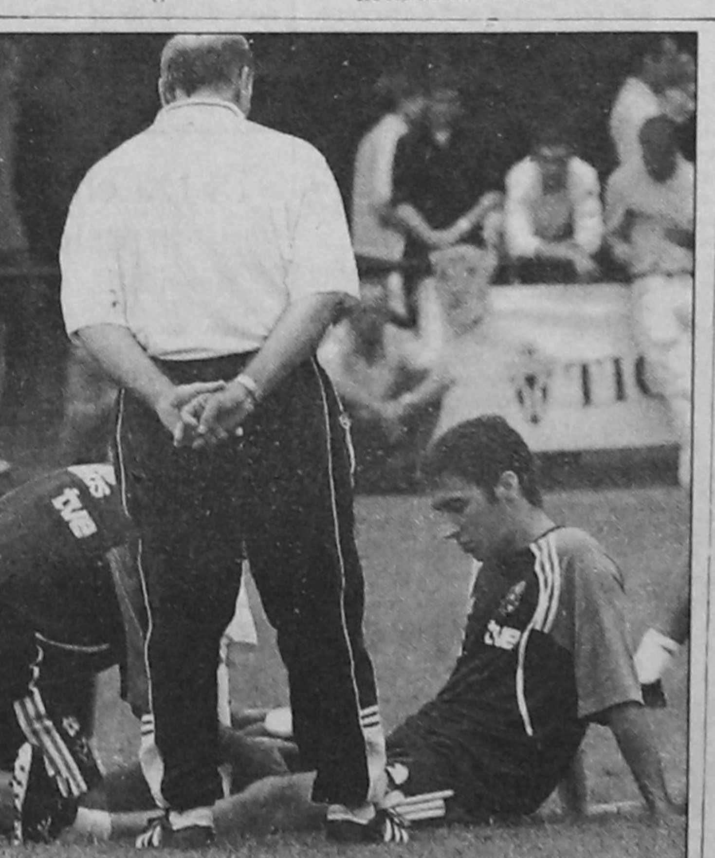
Spanish superstar Raul receiving attention from the team doctors after suffering a mild injury during practice at Tegelen on June 10. Spain take on Norway today in Rotterdam in an Euro 2000 Group C match.