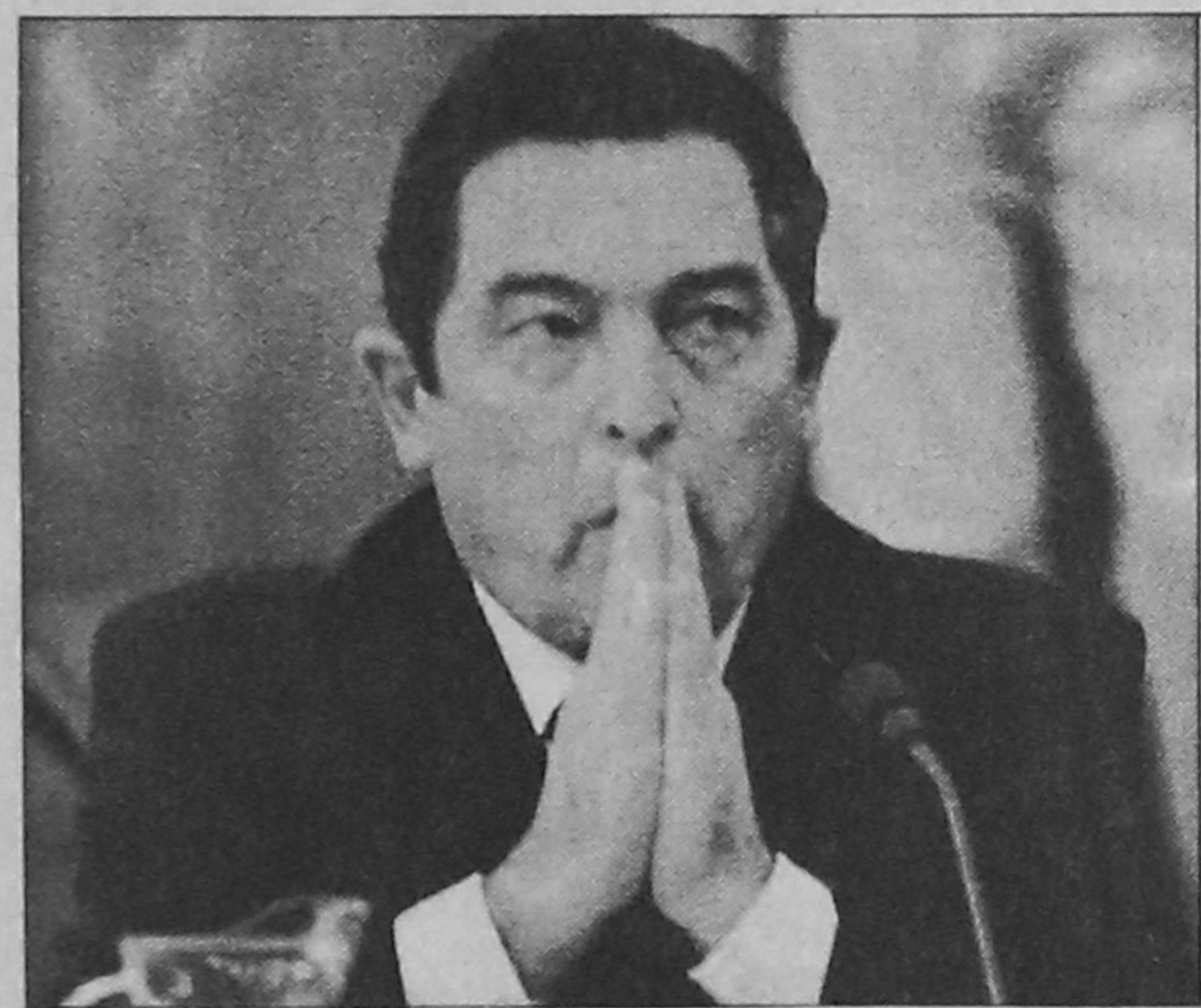
United Cricket Board chief, Ali Bacher testifies before the King Commission of Inquiry into cricket match-fixing allegations being held in Cape Town yesterday.

CAPE TOWN, June 12: South African cricket boss Ali Bacher made sensational claims today about match-fixing in international cricket, including matches of the 1999 World Cup in England, report agencies.