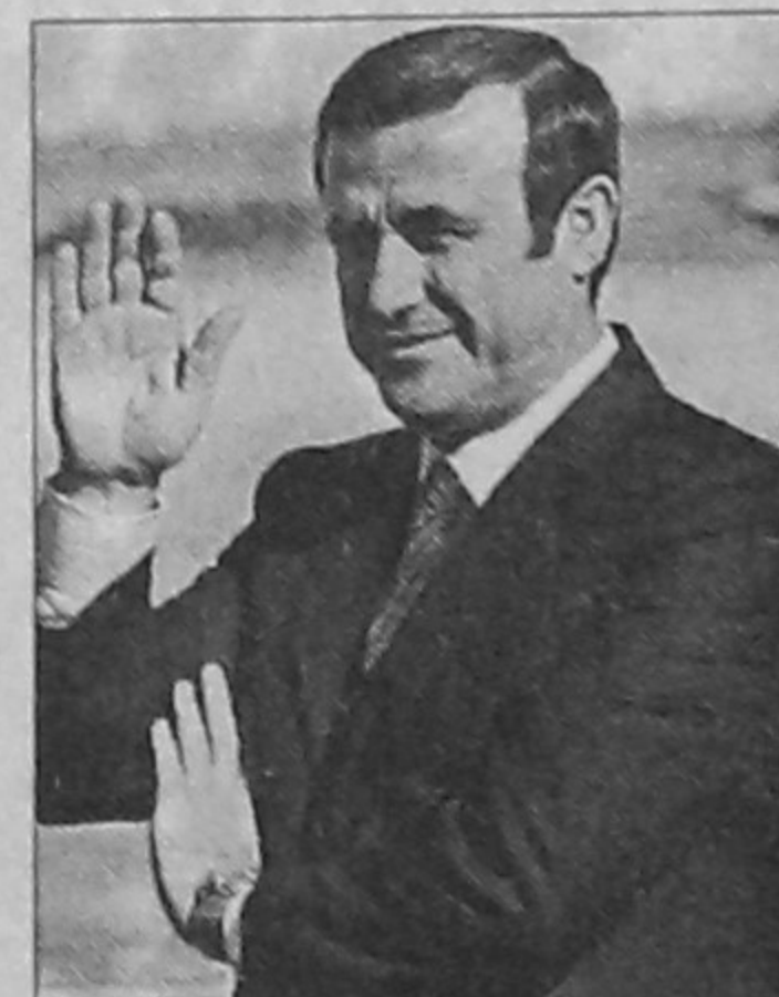
File photo of Rifaat

The London-based Arabic newspaper al-Hayat quoted a senior Syrian official as confirming that Rifaat, who tried