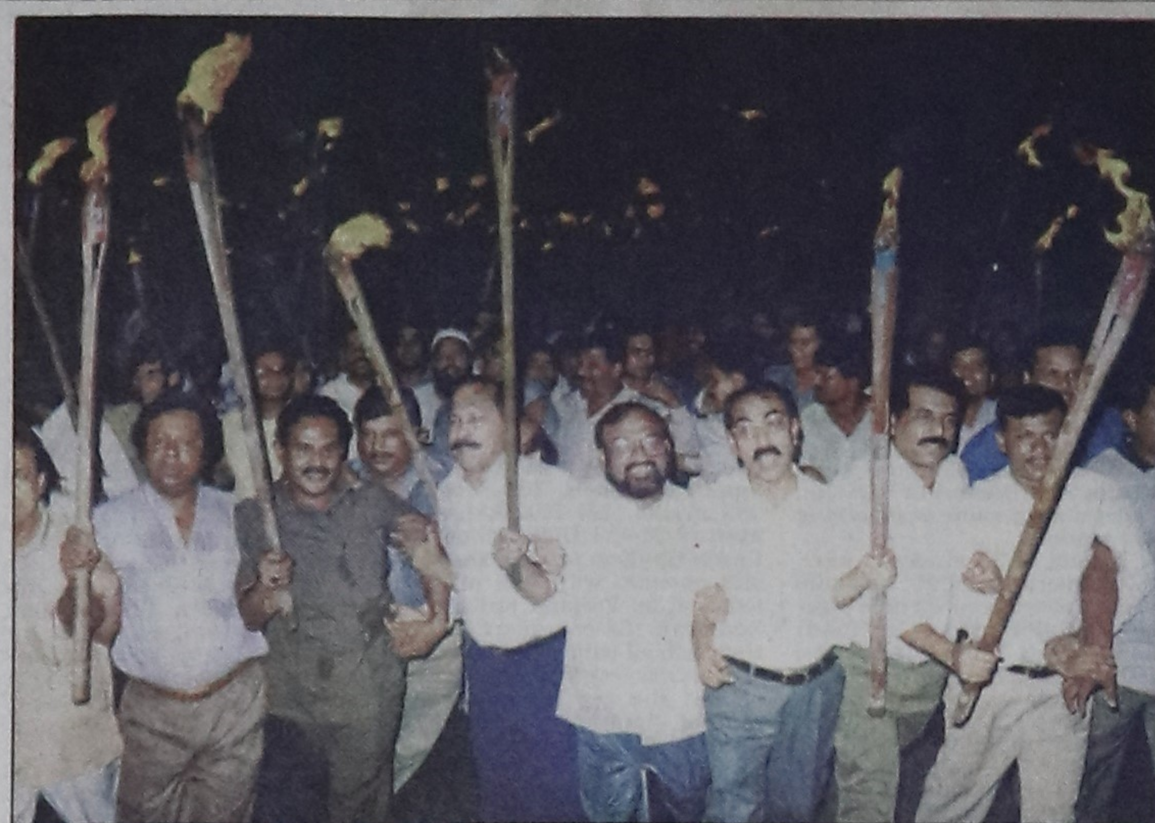
Main Opposition BNP brought out a torch procession in the city yesterday in support of today's dawn-to-dusk hartal.

Published by the Editor from Transcraft Ltd, 229, Tejgaon Industrial Area, Dhaka-1208 on behalf of Mediaword Ltd., 52 Motijheel C.A., Dhaka-1000. Editorial, News & Commercial Offices: 19 Karwan Bazar, Dhaka-1215, Telephone Numbers: 8124944, 8124955, 8124966, Fax: 8125155, GPO Box No: 3257, Cable: DAILYSTAR, DHAKA. Internet address: http://www.dailystarnews.com and Email address: dstar@bangla.net