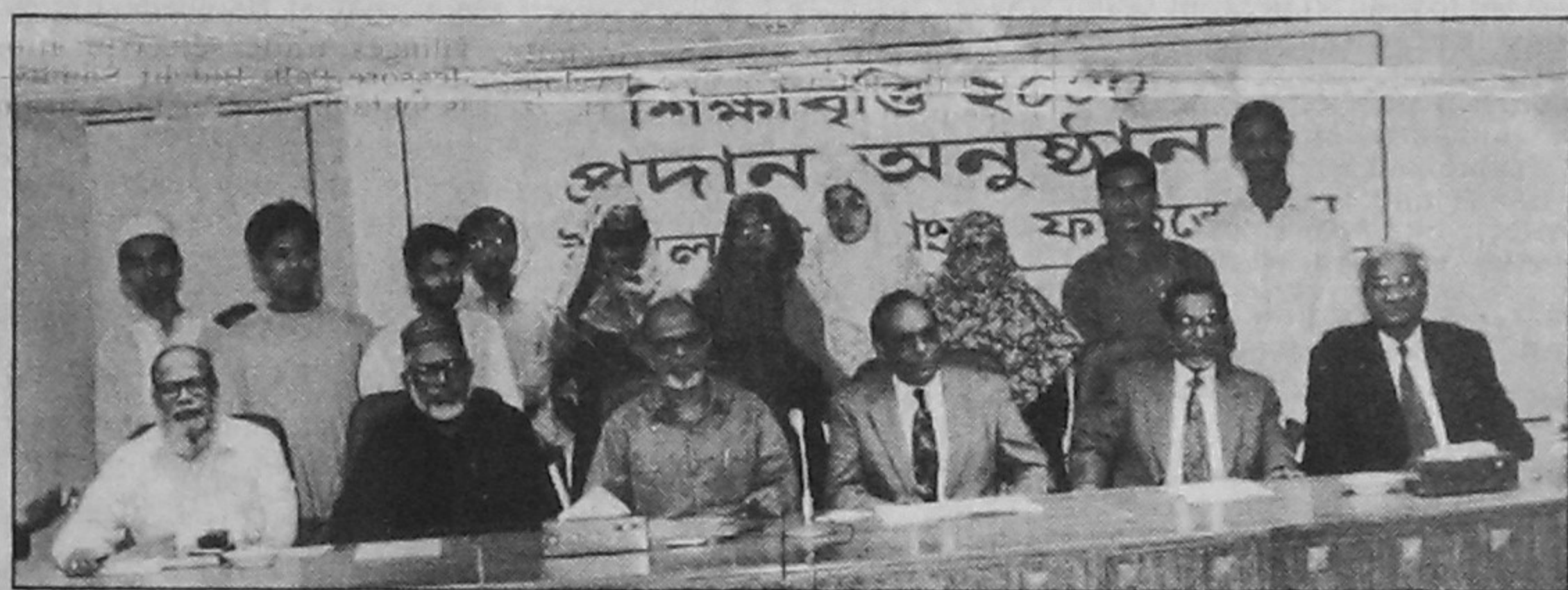
A function for distributing scholarship and stipend among meritorious students of different universities, colleges, schools and madrasahs of Dhaka Division by Islami Bank Foundation was held at the Conference Room of Islami Bank Tower on Saturday. Seen in the picture are some of the recipients with guests at the function.