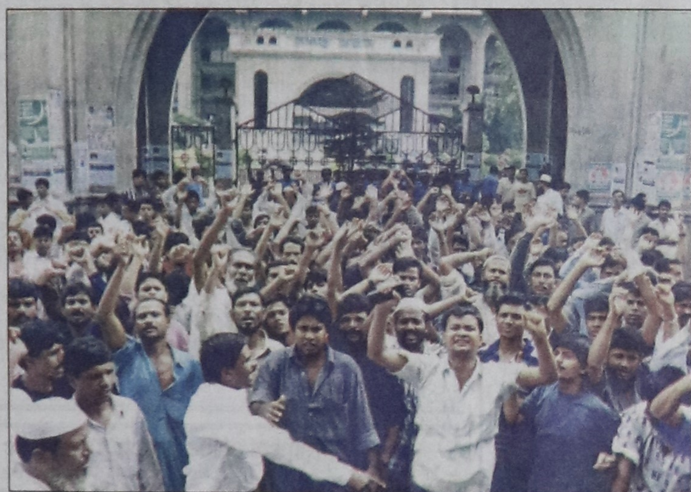
About 200 people demonstrated in front of Nagar Bhaban yesterday demanding return of their shops at Adarsha Market.

Four students each from St See page 11 col 1