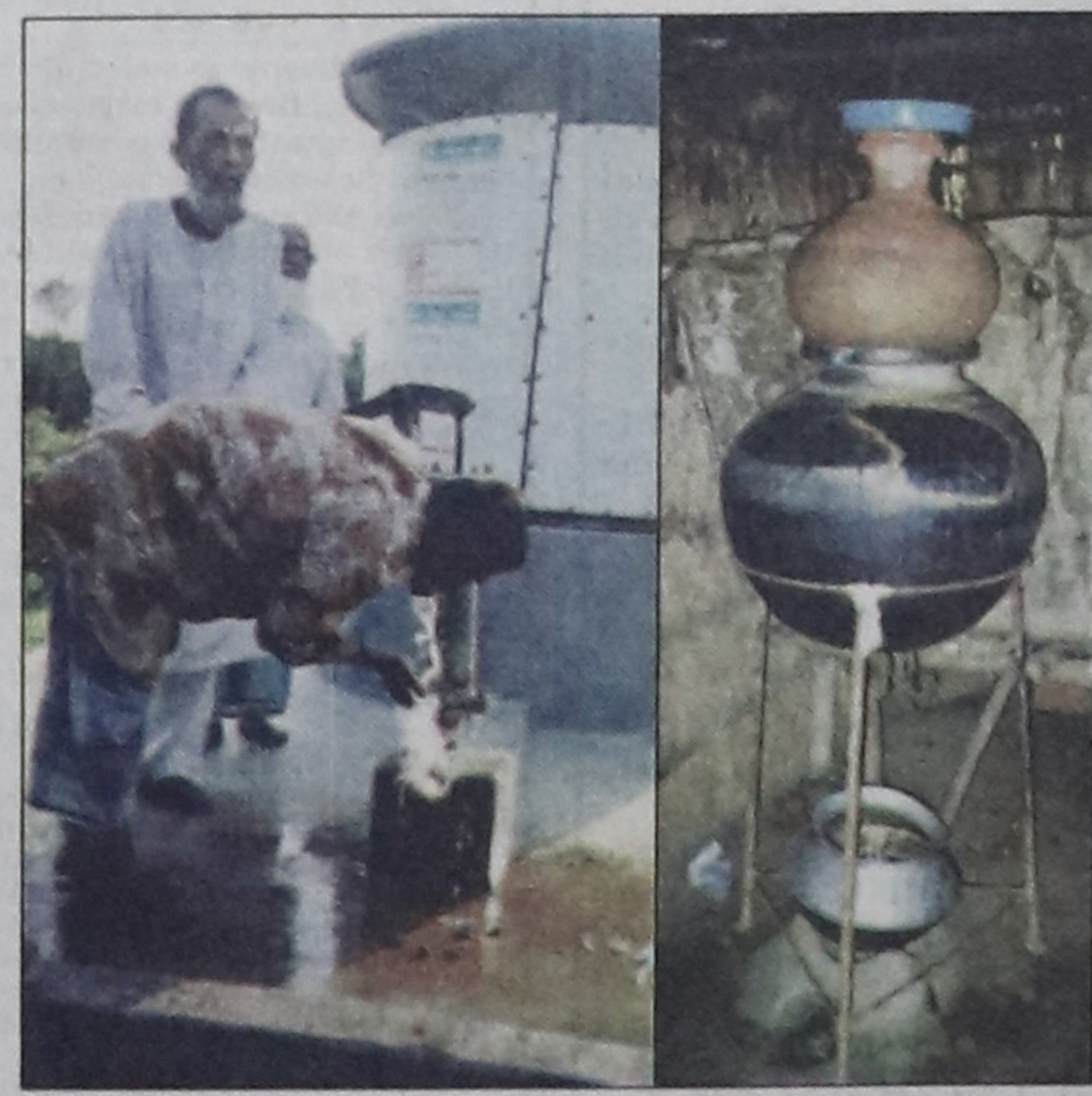
A man drinks water from tubewell at a village in Pabna's Bera thana (left) and the jar-based filter being used by villagers there.

"Data received from villages (816) where the experiment is in progress shows that the technologies have high rate of ac-