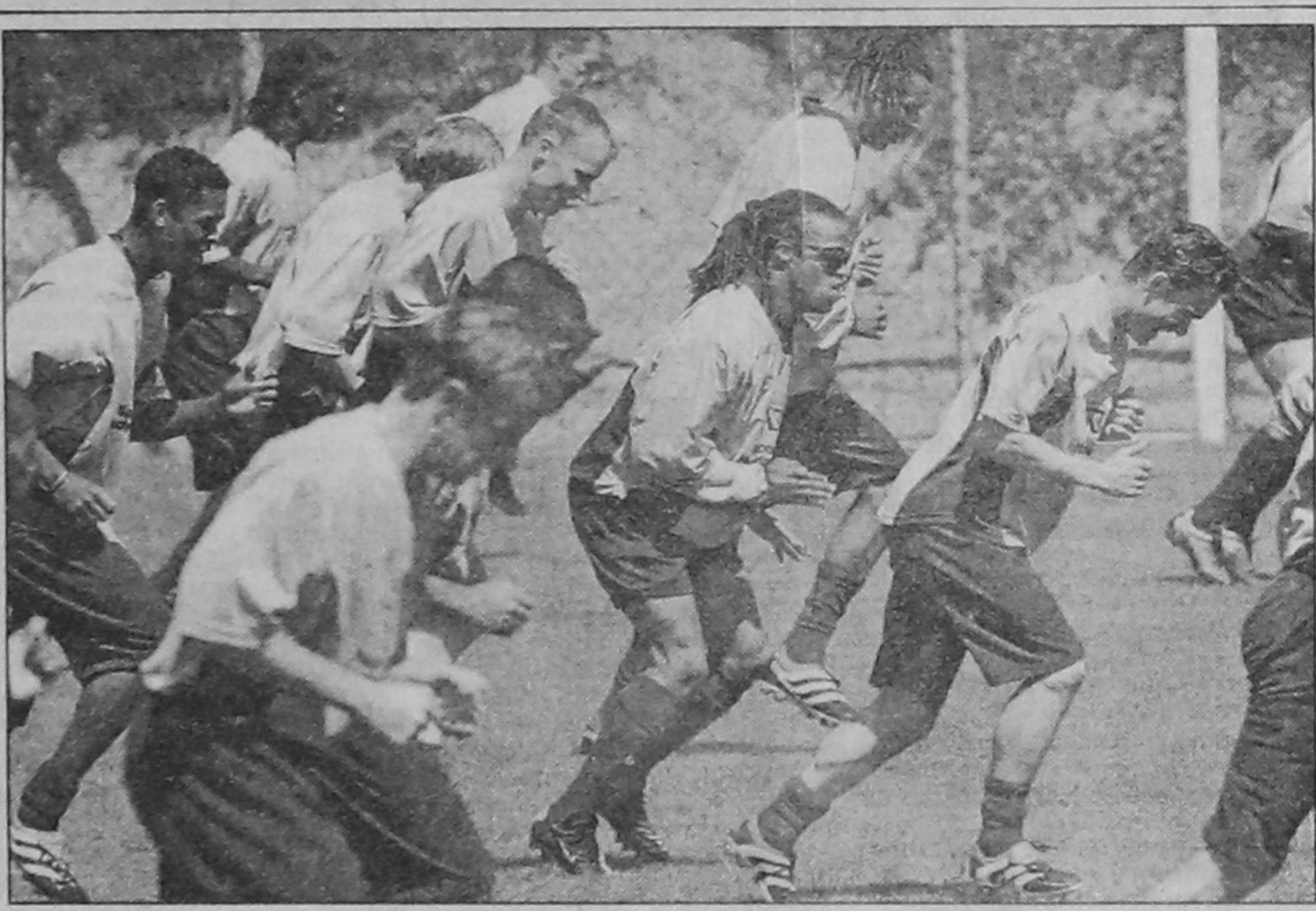
RARING TO GO: Dutch team members practise at Hoenderloo on June 9 ahead of their opening Euro 2000 fixture against Czech Republic which is today.

They are Elephant Road Branch and Stadium Branch. The phone numbers are 8665783, 8618392.