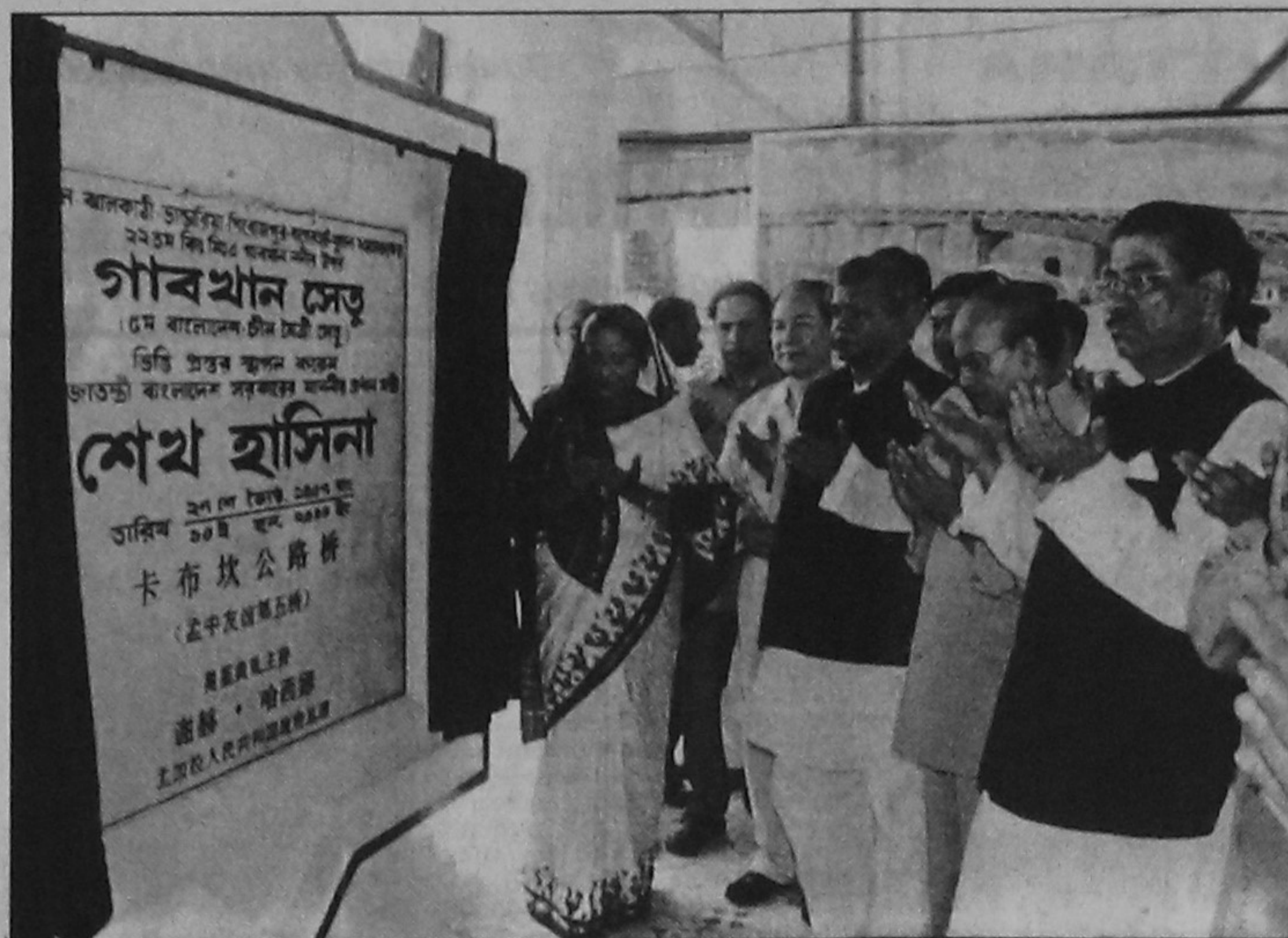
Prime Minister Sheikh Hasina laid the foundation stone of the 5th Bangladesh-China Friendship bridge yesterday. The bridge will be built over River Gabkhan at Jhalakathi.