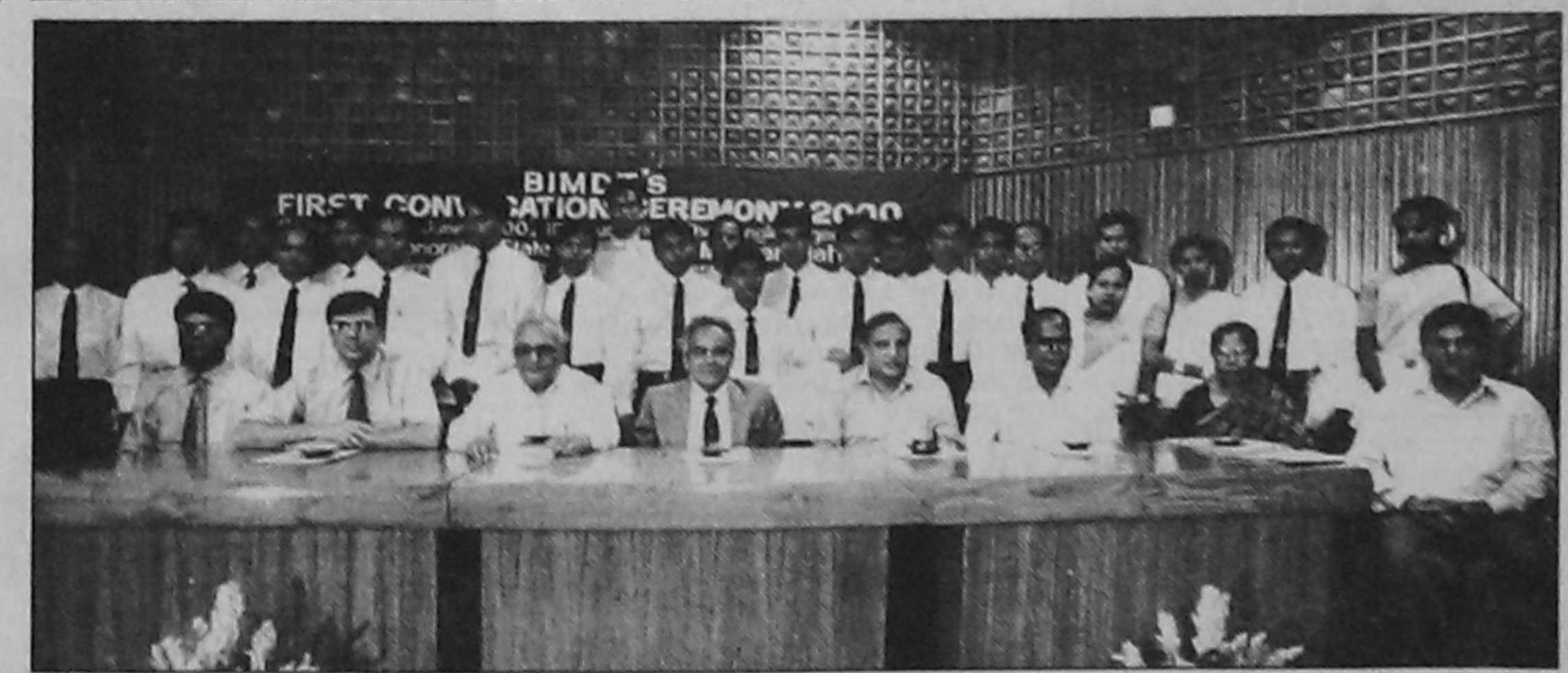
The first batch of graduates from BIMDT seen at the institute's 1st convocation ceremony held at the IDB Bhawan auditorium at Sher-e-Banglanagar in the city yesterday.