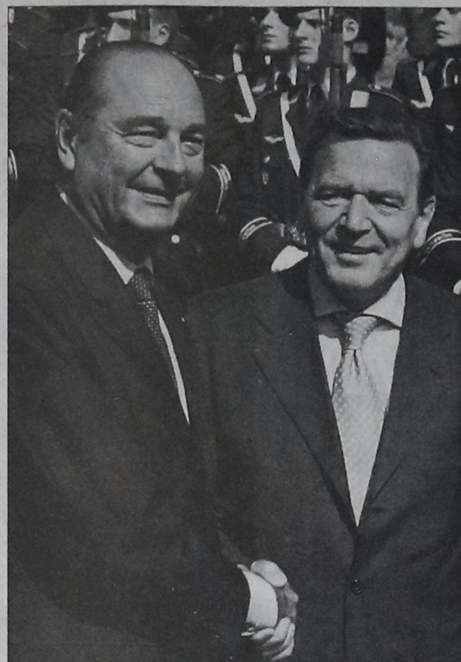
German Chancellor Gerhard Schröder (R) shakes hands with French President Jacques Chirac yesterday at the Liebfrauen square before the start of the 75th Franco-German summit.

The way-side city bazars are not an unmixed blessing. Their existence to cater to the needs of the low-income groups of people though felt to be inevitable, it has posed problems of encroachments on roads and pavements in many city areas to which the civic authority cannot remain blind. The need, therefore, is to plan for their suitable rehabilitation, keeping in view the interests of clean, orderly environment in city life.