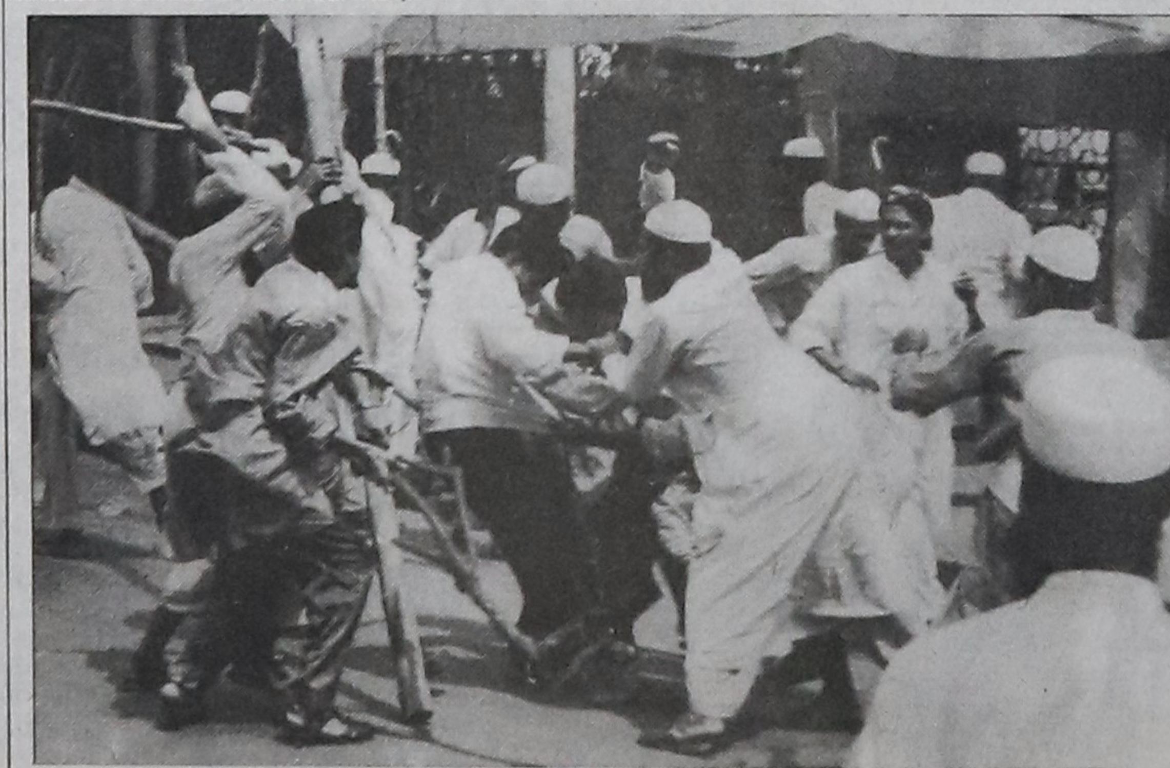
Followers of the peers of Charmonai and Dewanbagh engaged in violent clash near the Baitul Mokarram mosque yesterday. At least 25 people were injured.

A press release issued by the Islamic Constitution Movement confirmed the clash and said the organisation later held its rally at the north gate of Baitul Mokarram. The organisation will also hold a press conference at its party office at Purana Paltan today to protest the incident, the release said.