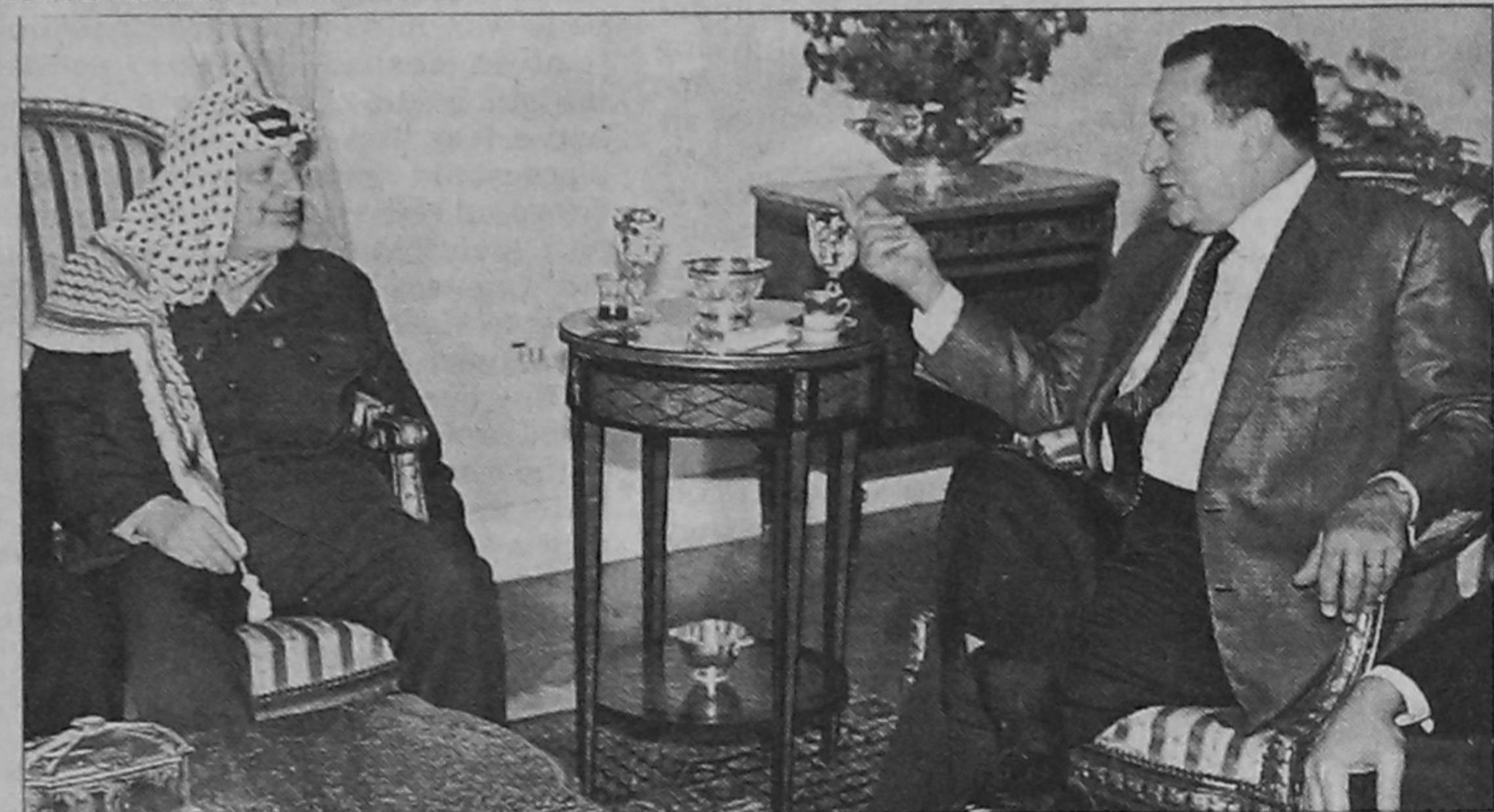
Palestinian leader Yasser Arafat (L) meets Egyptian President Hosni Mubarak in Cairo yesterday. Arafat's visit to Cairo comes before his upcoming summit with US President Bill Clinton in Washington.

"No decision was reached, nor was one expected," the military said.