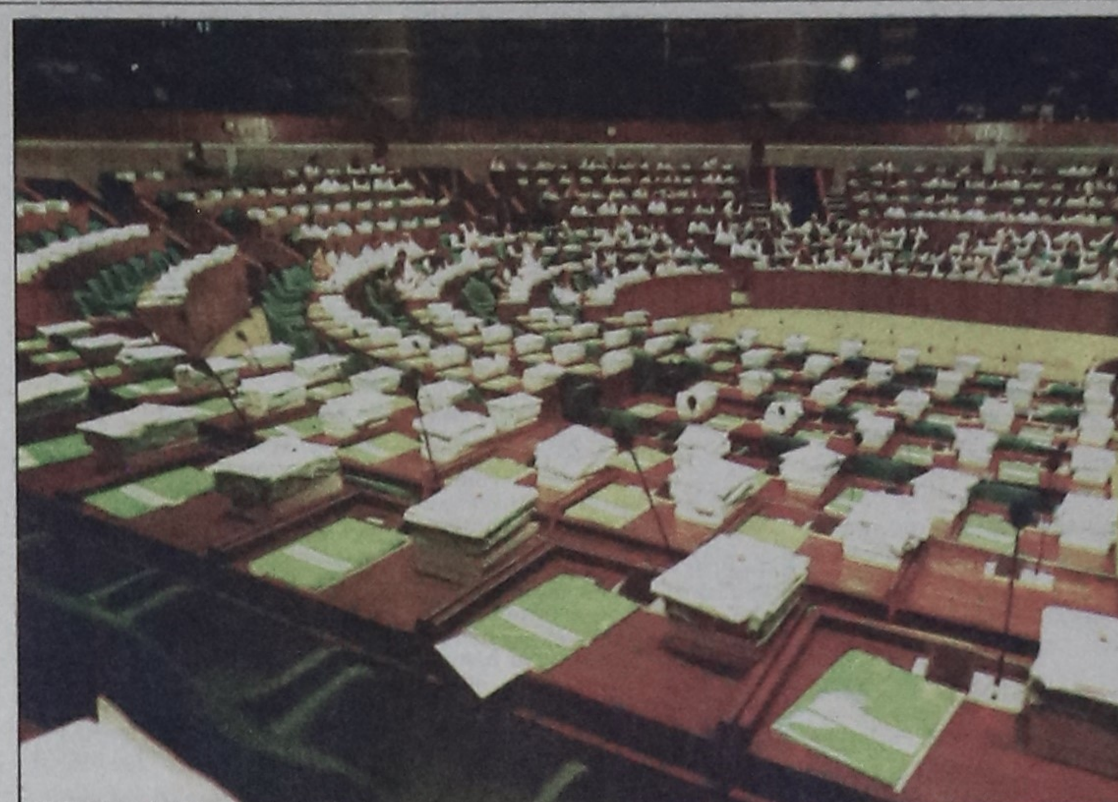
Deserted opposition bench during placing of the proposed budget for fiscal 2000-2001 in the Jatiya Sangsad yesterday.