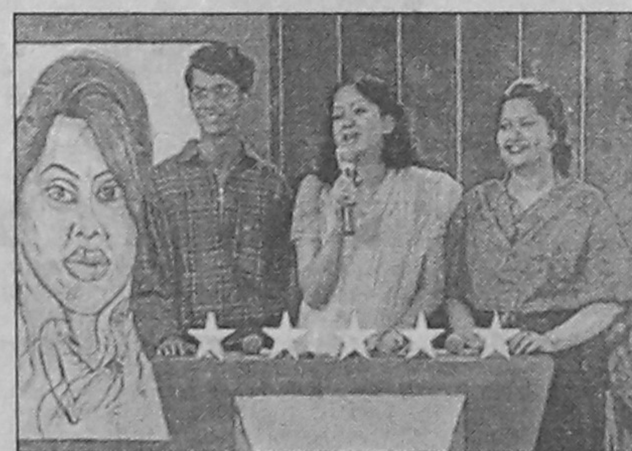
How are they? The successful and the achievers. They don't narrate the secrets of their success but join in lots of fun and games in the show 'Safal Yara Kemon Tara' on Ekushey Television, tonight at 9:30.

6:30 Aalap 7:00 Monihaar 8:00 Serial: Din Protidin 9:00 Serial: Plabon 9:30 Serial: Bhowani Purer Chattujia 10:00 Serial: Jhankar 10:30 Serial: Kono Ek Din 11:00 Serial: Samay Sur #11 11:30 Ek Akasher Niche 12:00 Serial: Mitir Bari #15 12:30 Serial: Shani Robi Majar Chobi 1:00 Aamar Tumi 1:30 Bahari Aahar 2:00 Serial: Abishasya #13 2:30 Bangla Movie- 5:00 Ek Akasher Niche 5:30 Asian Sky Shop 6:30 Serial: Din Protidin 7:00 Bharat Shromon 7:30 News In Banglali 8:00 Serial: Jiban Jiban 8:30 Serial: Ek Akasher Niche 9:00 Serial: Hiya Majhe 9:30 Serial: Daag 10:00 News In Banglali 10:30 Serial: Din Pro-