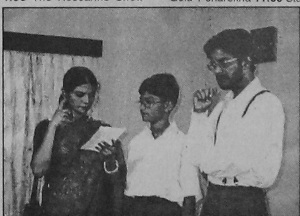
Children drama serial 'Bubuner Baba' on Ekushey Television tonight at 7:20. Written by Mohammad Zafar Iqbal, the serial is directed by Morshedul Islam.

8:00 Late Show With David Letterman 9:00 Too Close For Comfort 9:30 Evening Shade 10:00 Music Zone 10:30 The Roseanne Show 11:30 The Lifestyle Show 12:00 The Academy Awards Winners 1:00 The Roseanne Show 2:00 Music Zone 2:30 Friends 3:00 Evening Shade 3:30 The Academy Awards Winners 4:30 The Roseanne Show