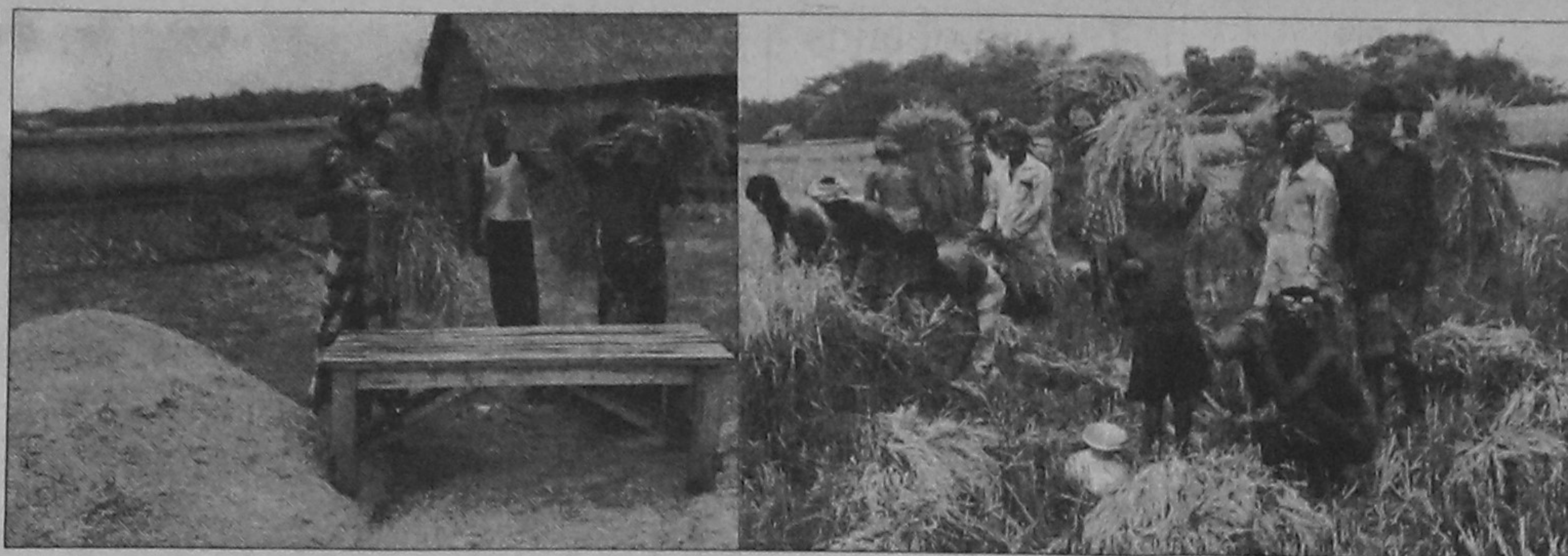
Golden paddy: Now is the peak season of IRRI-Boro harvesting. So the farmers of Jamalpur district are very busy in reaping their produce. Photo shows farmers and land labourers of Mollahpara under the Sadar upazila passing hectic time.

The gang of thieves were engaged in breaking of the ship MV Riveg which had been beached there for scraping after it had developed a hole at its bottom two months back, police said.