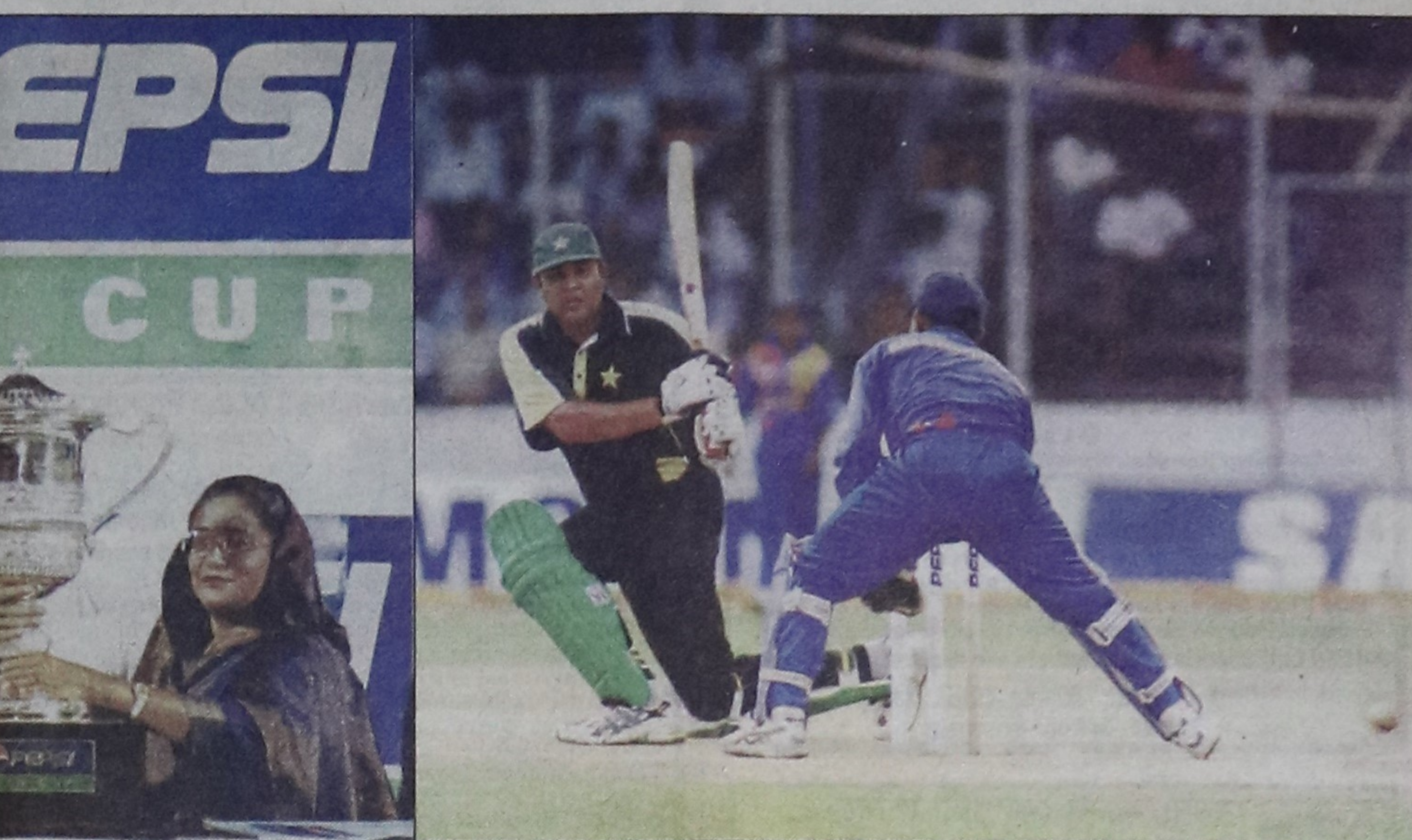
Prime Minister Sheikh Hasina hands over the Pepsi Asia Cup trophy to Pakistan captain Moin Khan after the final (left), and Pakistan's star batsman Inzamam-ul-Haq plays one down fine leg on his way to an unbeaten 72 off 66 balls in the final of the Pepsi Asia Cup at Bangabandhu National Stadium yesterday.