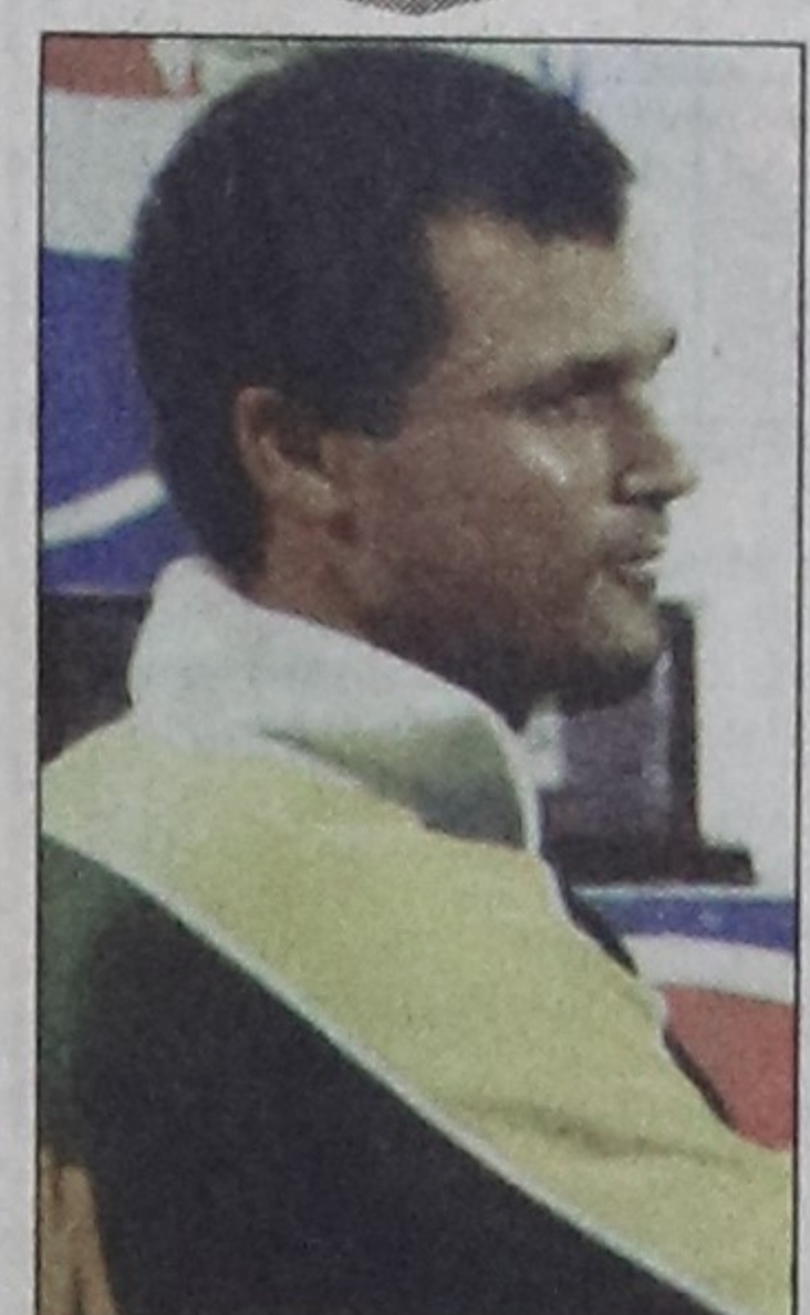
Moin Khan of Pakistan