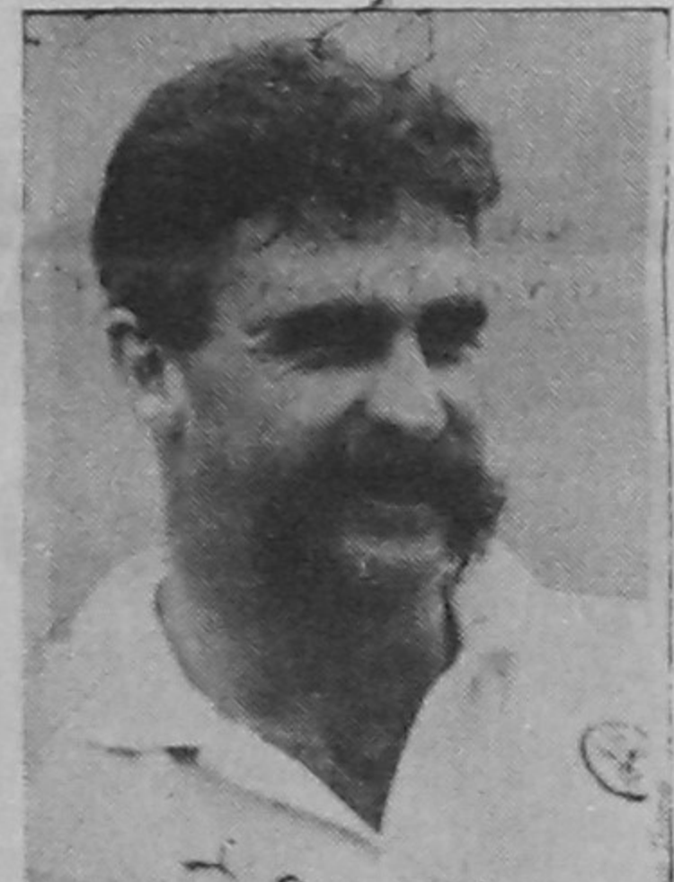
Merv Hughes (Former Australian fast bowler) "When Australia lose, we look for reasons. When England lose, they look for excuses."