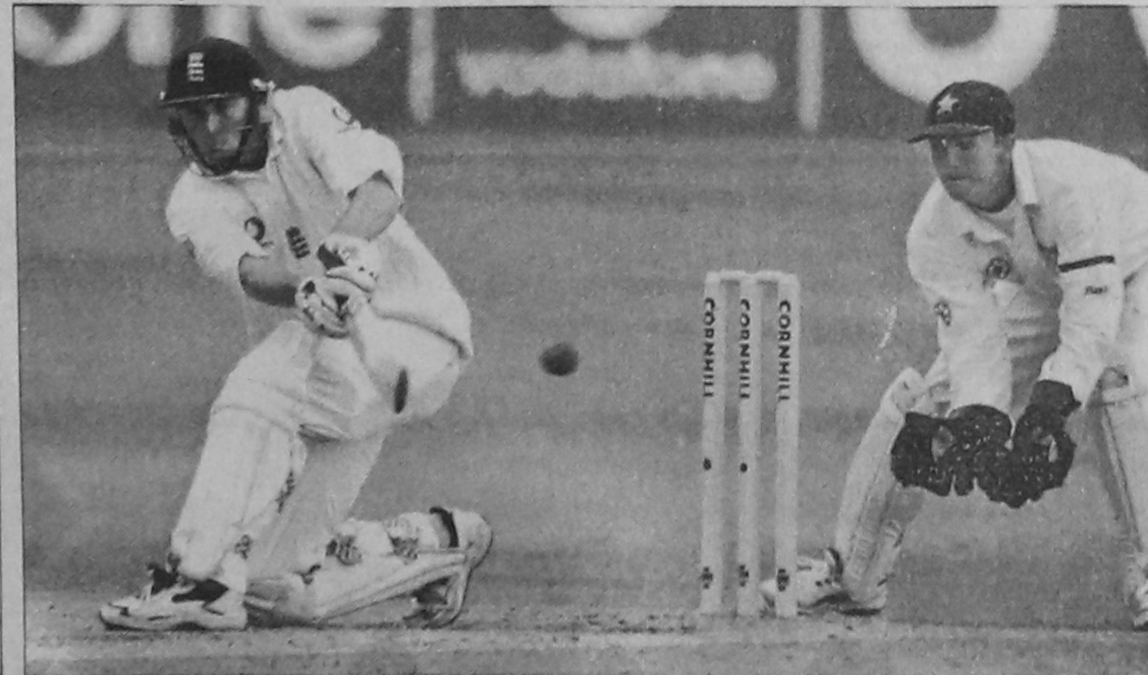
England's Michael Atherton plays a sweep shot on the fifth and final day of the second Test against Zimbabwe at Trent Bridge on June 5.