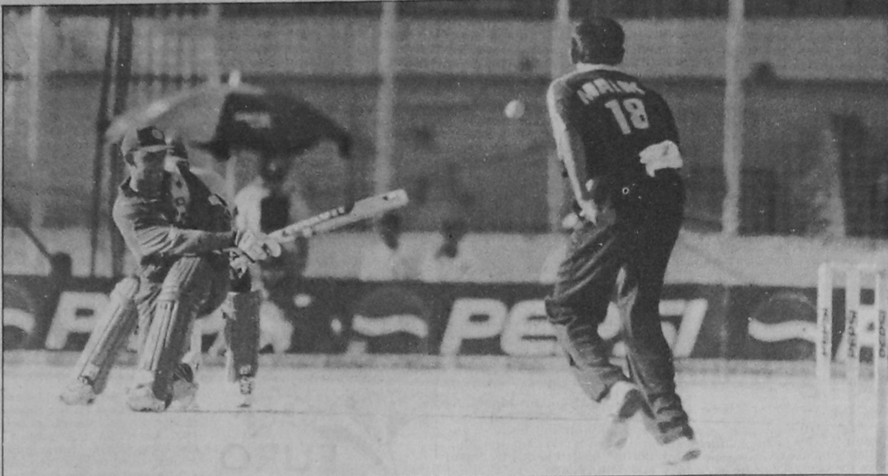
Elegant Sri Lankan batsman Marvan Atapattu sweeping Pakistan off-spinner Shoab Malik.