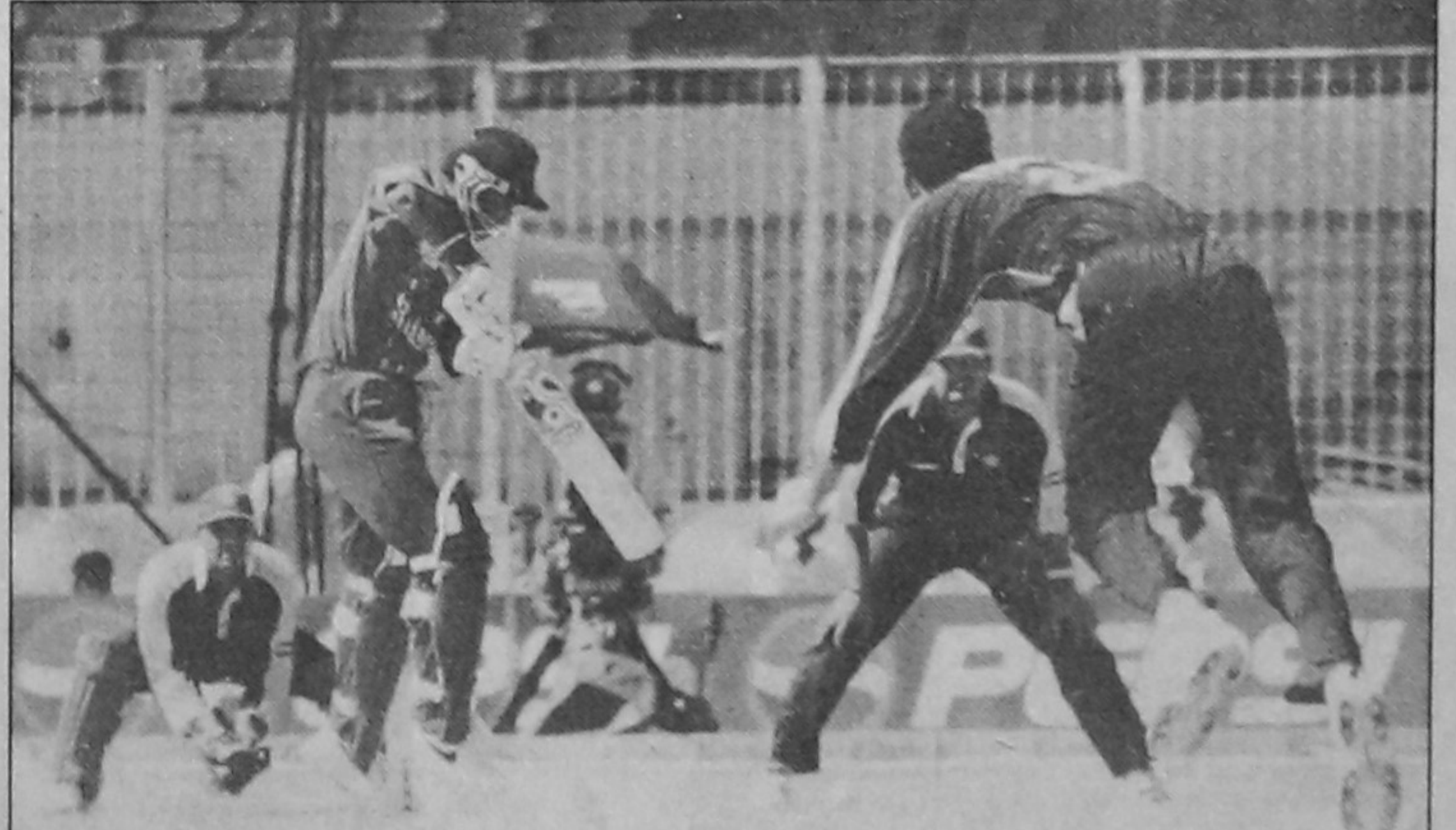
Sri Lankan skipper Sanath Jayasuriya jumps while trying to negotiate a delivery from Pakistani pacesman Shabbir Ahmed yesterday.