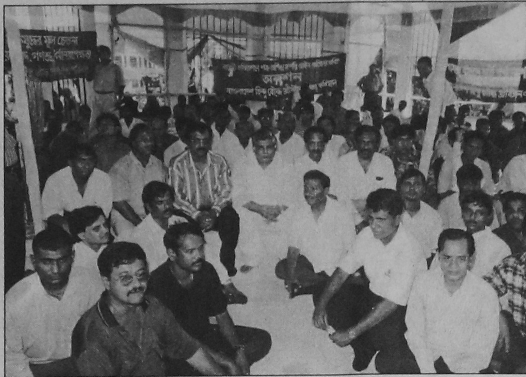
Hindu-Buddha-Christian Oikhya Parishad observed a token hunger strike at the Central Shaheed Minar demanding repeal of Vested Property Act.