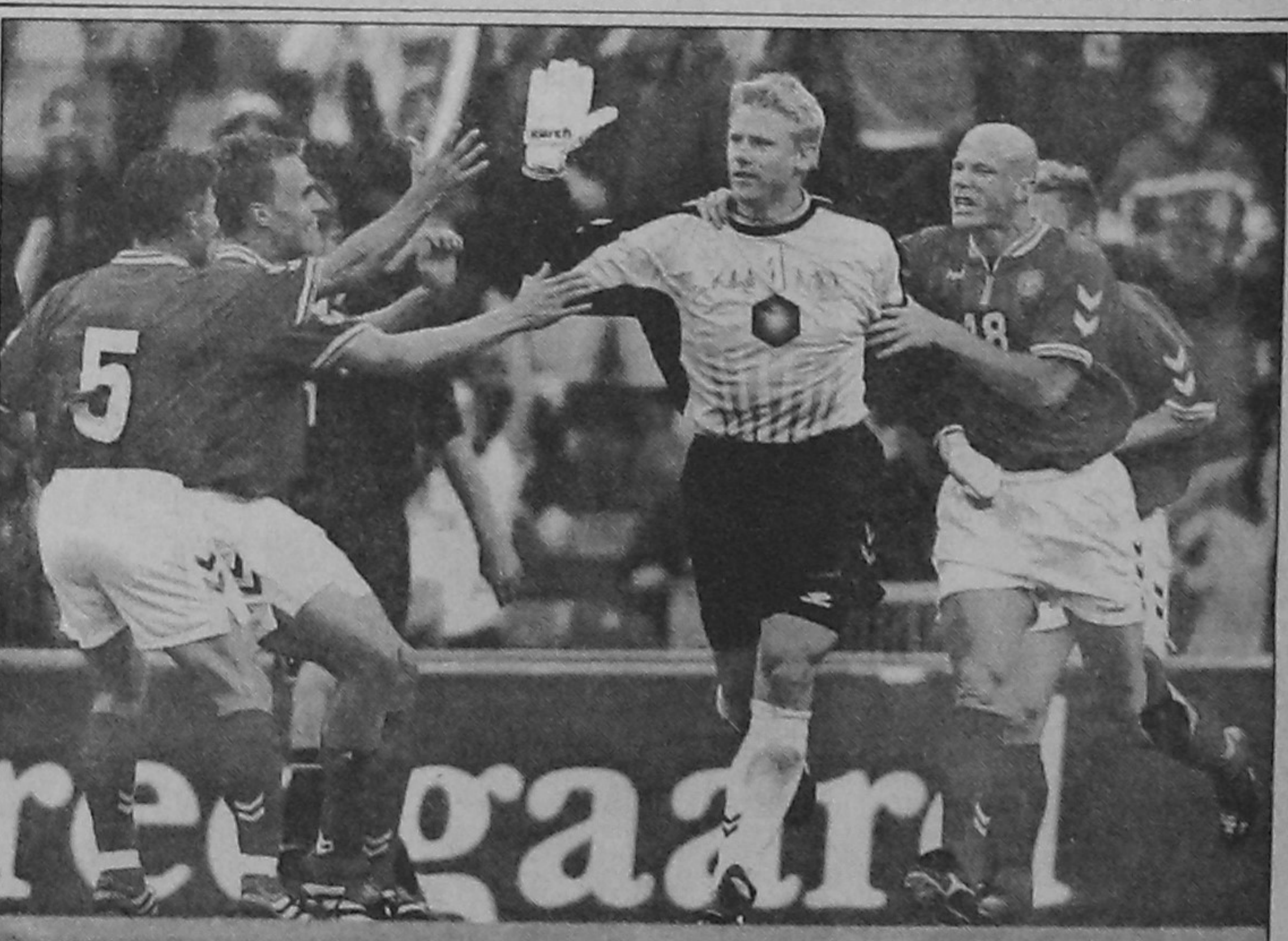
Peter Schmeichel (C), the champion Danish goalkeeper, being congratulated by teammates after scoring from the penalty spot against Belgium during a Euro 2000 warm-up match at Copenhagen on June 3.