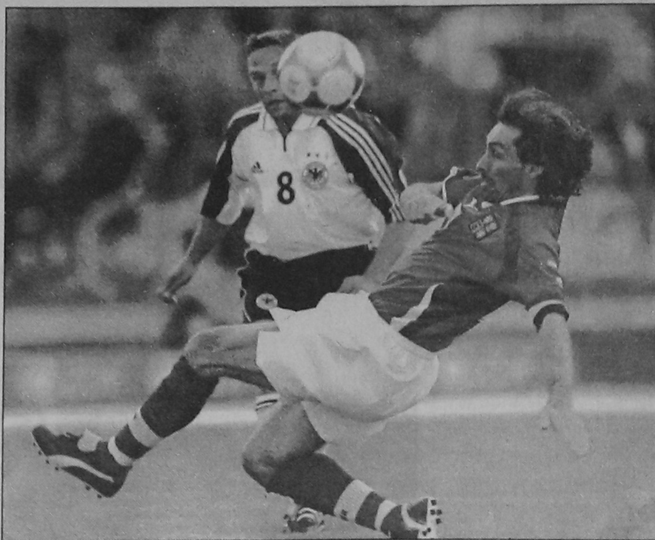
Jiri Nemec (R), the Czech Republic defender, tackling Germany's veteran play-maker Thomas Haessler during their Euro 2000 warm-up on June 3.

"I enjoy being out there, the centre of attention. I suppose, in a big arena, I'm not afraid of it all. I have very little fear when I go out there."