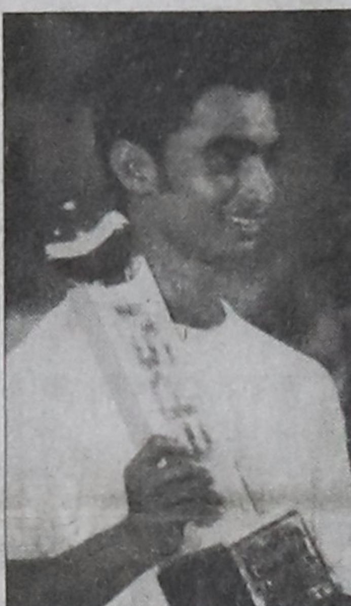
Imran Nazir of Pakistan