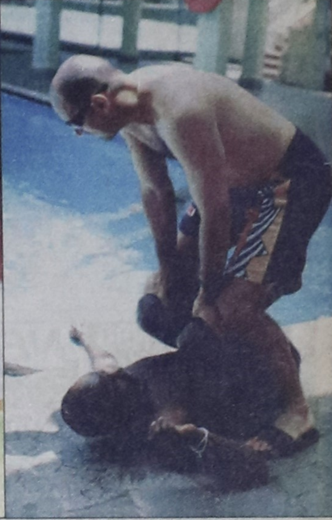
A combo picture shows boisterous Bangladesh fans (left) celebrating the dismissal of dashing opener Saeed Anwar (middle) during yesterday's Pepsi Asia Cup fixture between the hosts and Pakistan at the Bangabandhu National Stadium, and (right) Sri Lanka's skipper Sanath Jayasuriya do a bit of stretching at their hotel swimming pool. The defending champions take on Pakistan on Monday.