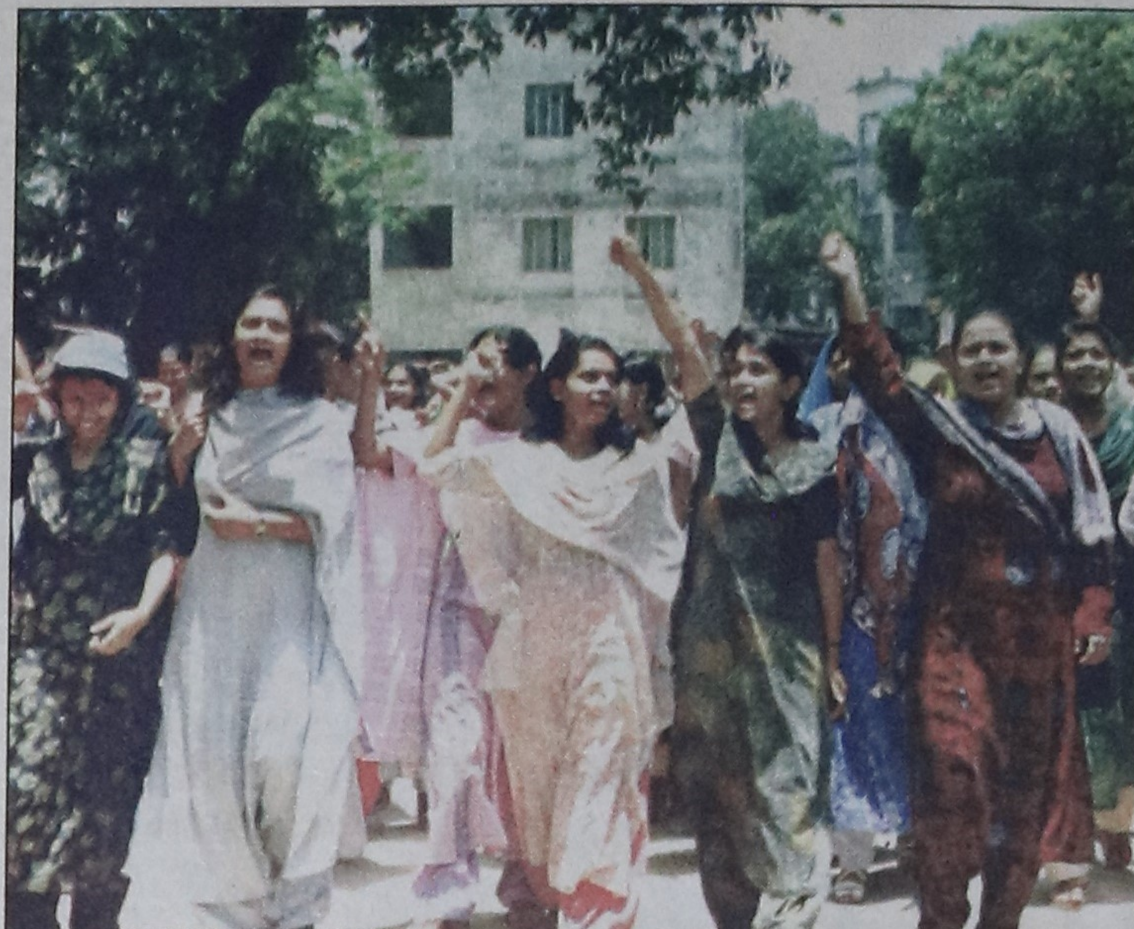
Students of Eden University College brought out a procession yesterday demanding deferment of honours examinations (third part) under the national university.