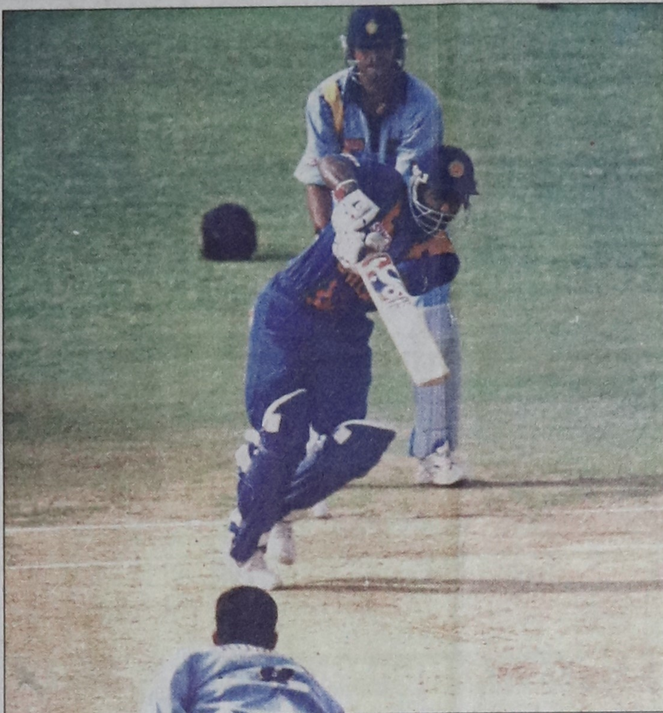
Sri Lankan skipper Sanath Jayasuriya executes an exquisite cover drive on his way to a sterling century in yesterday's Pepsi Asia Cup cricket match at the Bangabandhu National Stadium.