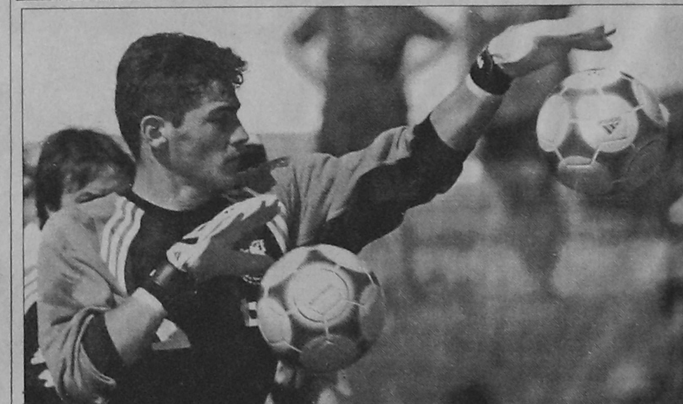
Iker Casillas, the highly impressive 19-year-old custodian of Real Madrid, in training with the Spanish national team at Valencia yesterday. The national squad is preparing for the European Championship beginning June 10.

The final 22 will be named after today's Wembley friendly against Ukraine.