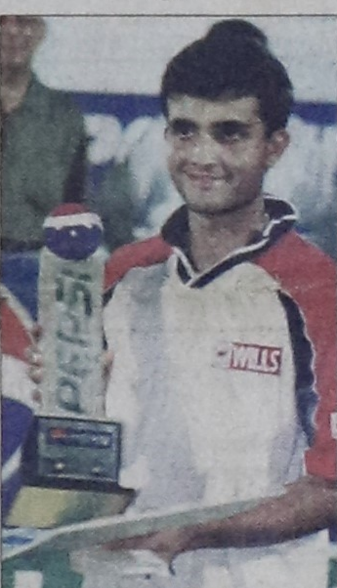
Saurav Ganguly of India