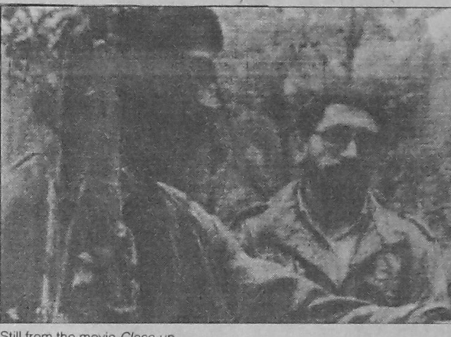
Still from the movie Close-up