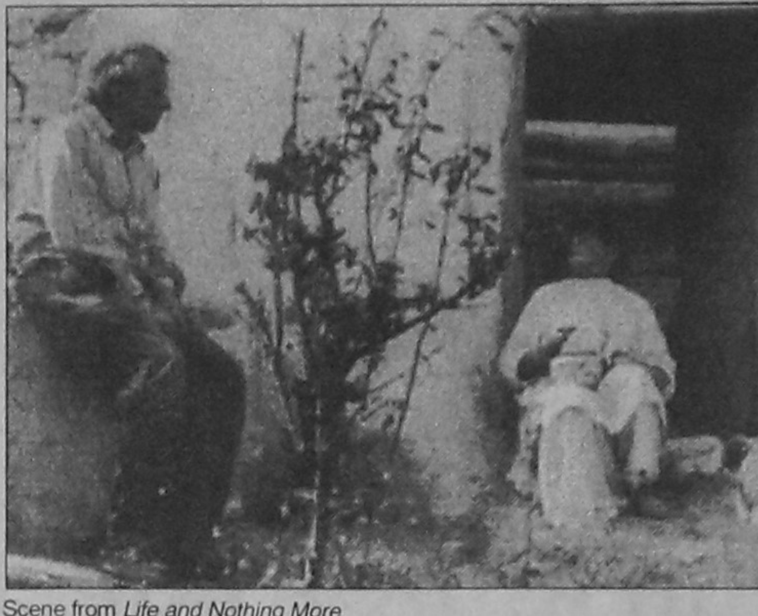
Scene from Life and Nothing More

Feature Films The Traveller (1974) The Report (1978) First - Graders (1984) Where is the Friend's Home (1988) Homework (1988) Close-Up (1990) And Life Goes On (1993) Under the Olive Trees (1994) The Taste of Cherry (1999) The Wind Will Carry Us (1999)