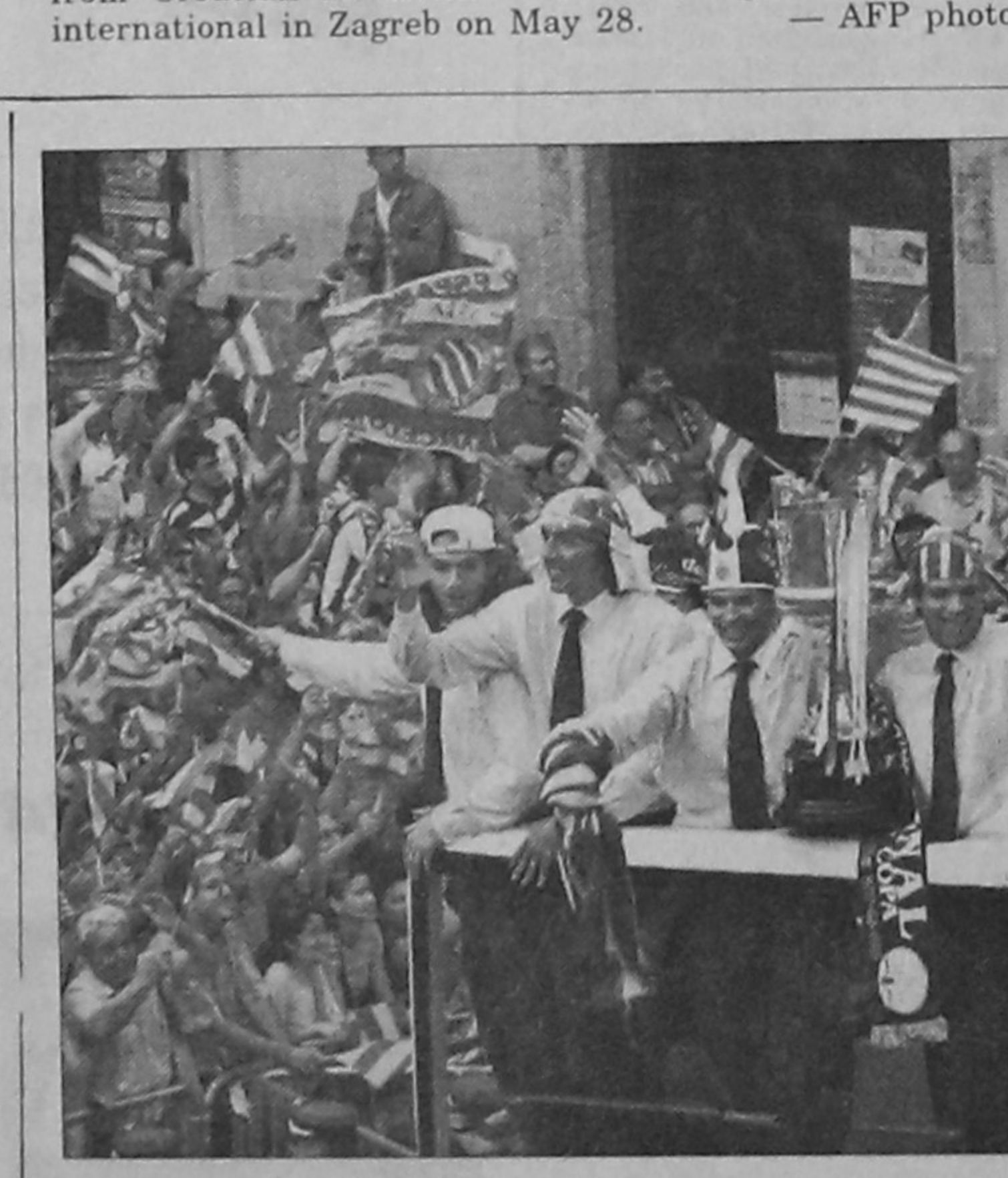
Espanyol players celebrate after clinching the Spanish Cup title on May 28.