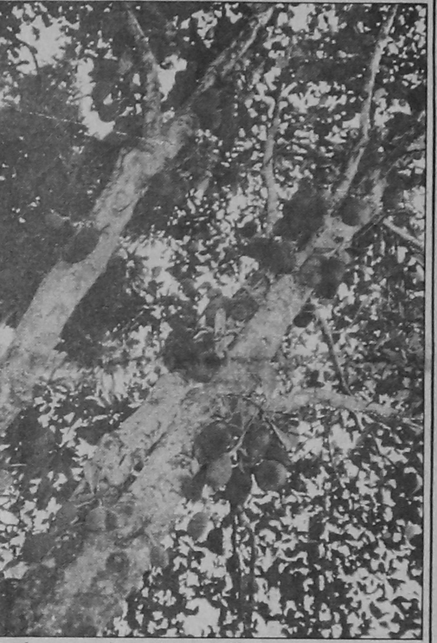
Good output of our National Fruit A bumper production of jackfruit has been achieved in Sirajganj district this season. Picture shows a tree full of jackfruits in Shaluvaita area under the Sadar thana.