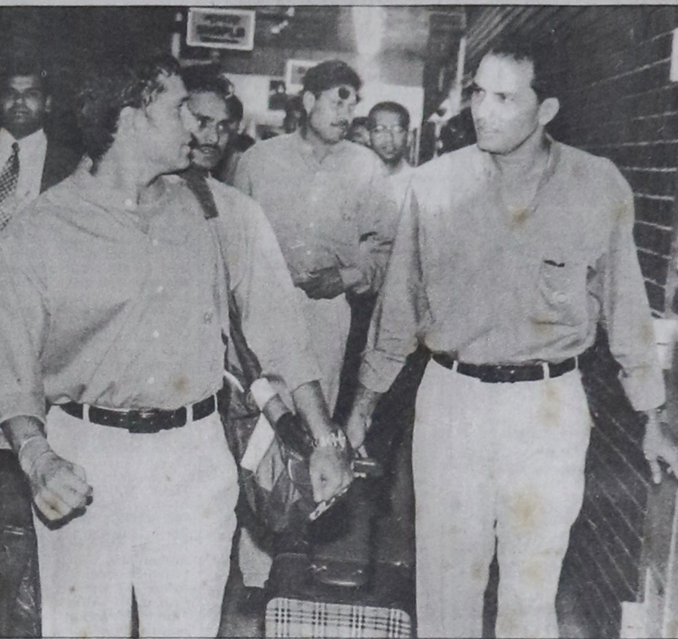
Indians in the town: Star batsman Sachin Tendulkar (left) and Mohammad Azharuddin (right) talk at the ZIA on their way to board the hotel bus. The Indian team for the Pepsi Asia Cup arrived here yesterday.

ing at its highest ever level. The swelling waters breached its embankment at Ranchap and Gazipur villages under Kulara upazilla and Kamarchak and Haripasa villages under Rajnagar upazilla. The Dholai, also flowing above danger level, tore through its embankment at Bade-Karimpur and Basudevpur villages. The worst affected unions are Tilaganj, Hazipur and Shariatpur in Kulara upazilla. See page 11 col 7